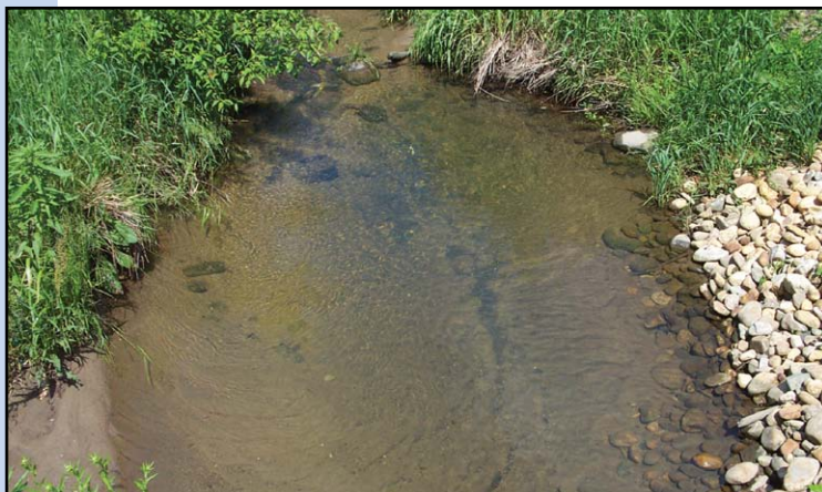
Figure 2. Excessive sedimentation is a contributing cause of degraded habitat in Eagleville Brook.