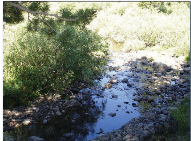
USFS Meiss/ Dardanelles Backcountry photos on Flickr

Since at least 1990, water quality violations for FC bacteria have occurred. Analysis of surface water samples taken from Big Meadow Creek and the Upper Truckee River during and immediately after cattle grazing demonstrated that cattle were the major source of FC bacteria. Because FC levels exceeded the water quality objective, the Lahontan Water Board issued the USFS-LTBMU a Notice of Violation and added 4.5 river miles of the Upper Truckee River (above Christmas Valley) and 1.4 river miles of Big Meadow Creek to the 2002 CWA section 303(d) list of impaired waters.