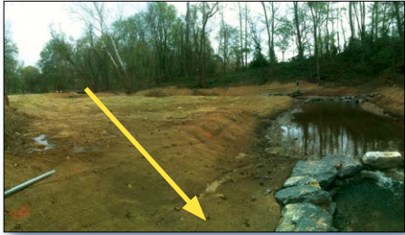
Figure 2. Project partners removed three feet of accumulated sediment and reconnected Watts Branch with its historical stream channel. Before the restoration effort, Watts Branch followed the path denoted by the yellow arrow.