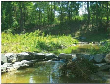
Figure 3. After restoration, vegetation is returning to the Watts Branch riparian restoration project site shown in Figure 2.

restore a 1.7-mile segment of Watts Branch. These partners: