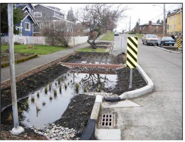
Figure B - Curb Extension Design Example