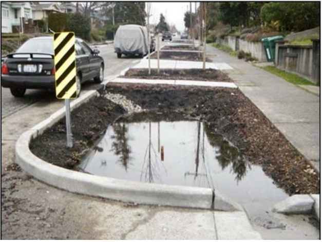
Figure C - Full Curb Shift Example