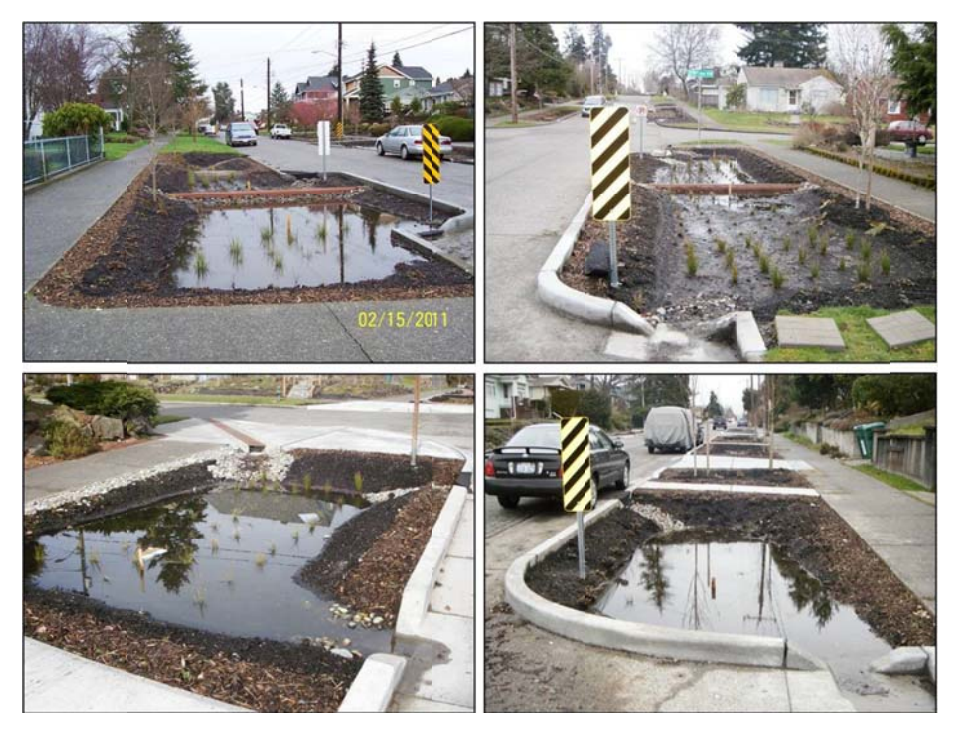
Figure G - Examples of Nonperforming Cells and Community Concerns

Figure G illustrates some of the non-functioning cells and the community concerns, such as long-term ponded water, the large black and yellow striped object marker signs, the parking restrictions, cell depth, and general aesthetics.