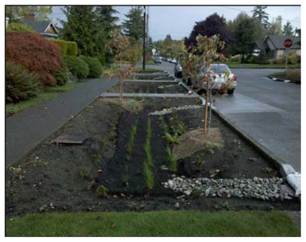
Figure A - Planting Strip Design Example

Due to the tight timeline, this project skipped preliminary engineering and moved directly into 30 percent design. In addition, in an effort to keep soft costs down and pilot the implementation of template designs, no survey was completed and the exact location of the cells had to be field directed, meaning that because there were no survey points to identify the specific cell locations, the design engineer had to work with the contractor to identify in the field where each cell should begin and end. This approach was identified when SPU thought that the project would only involve working in the planting strip (Figure A) or adding curb extensions (Figure B) along a small portion of the block length. However, it was not revisited for the design involving full half block improvements (Figure C).