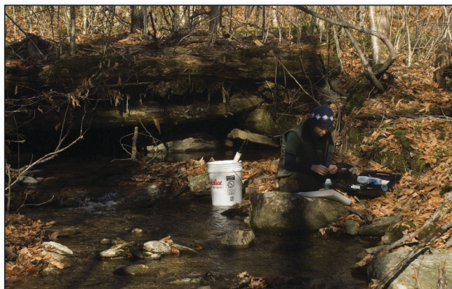
Figure 2. A VTDEC staff member collects biomonitoring data.