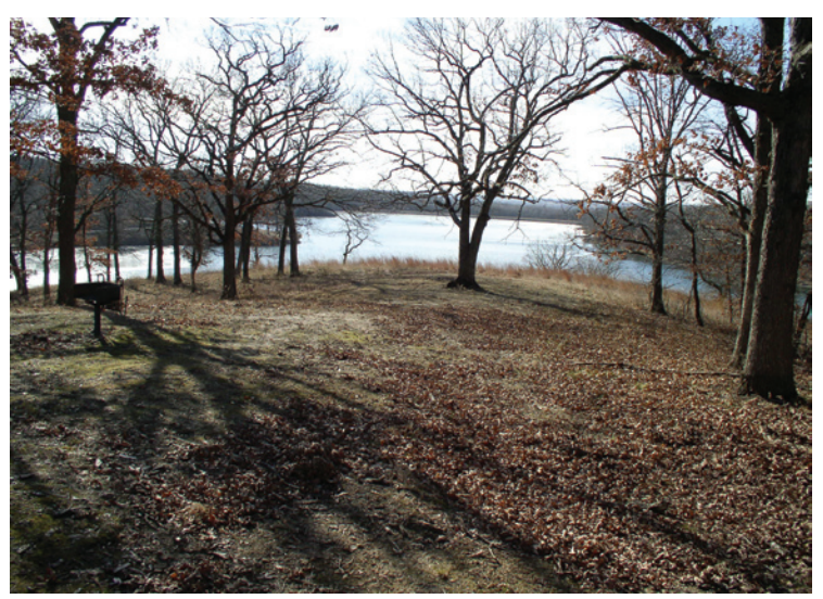
Nine Eagles Lake is a popular recreation area where visitors enjoy swimming, boating, and fishing.

To accomplish these goals, IDNR developed an implementation plan for Nine Eagles Lake focusing on reducing sediment delivery in the watershed. Section 319 grant funds were used to construct 17 sediment basins. In 2003 the IDNR Parks Bureau rerouted and reworked some of the trails to reduce impacts. Throughout the project, care was taken to protect the forested areas, home to the endangered Indiana bat.