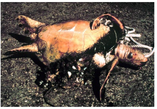
Several marine mammal, sea turtle, and bird species are in danger of extinction in large part from entanglements in fishing gear and other debris. This turtle was killed by boat debris.

If you've ever accidently splashed a little gasoline on your hands when filling a car tank, you know that gas smell is pretty powerful and sticks around a long time. In fact, as little as one quart of oil or gasoline can contaminate up to 250,000 gallons of water. So here we have a dilemma—motors on powerboats need oil and