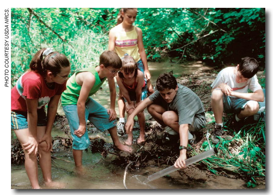
These volunteer monitors are collecting water samples from a small stream.

Another activity that can use the help of you and your friends is clean-up campaigns. Typically, teams are organized to pick up and remove trash and debris from a section of stream, beach, wetland, or lakeshore. The cleanup can be a onetime activity or, better yet, an ongoing project where the team "adopts" an area and visits it regularly.