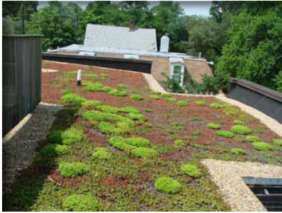
Artists' Housing Green Roof