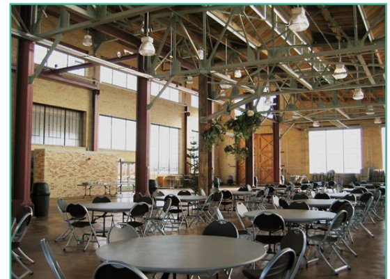
The Machine Shop has been converted to a premier event space.

Through the early 1990s, as the demand for rail maintenance decreased, the city considered historic restoration options for the Roundhouse Complex. Because the property had been used as a maintenance and repair facility, the city was concerned about environmental contamination. In addition, the site's buildings were in dire need of repair. In 1994, the city funded a preliminary environmental assessment and an architectural study to better understand potential restoration and reuse opportunities. Additional environmental assessments were necessary and in 1998, Evanston received the funding it needed through a $200,000 EPA Brownfields Assessment Grant. An additional $200,000 in supplemental and greenspace funding was also provided by EPA. The assessments were completed in the summer of 2001 and identified asbestos, lead, benzene, and arsenic. Cleanup began on the Machine Shop in October 2002, at an estimated cost of $140,000. Investigation and cleanup activities were conducted under Wyoming Department of Environmental Quality's Voluntary Remediation Program, with $200,000 provided by WYDEQ for cleanup and construction of the Machine Shop parking lot. Groundwater on the property continues to be monitored to ensure the cleanup's integrity.