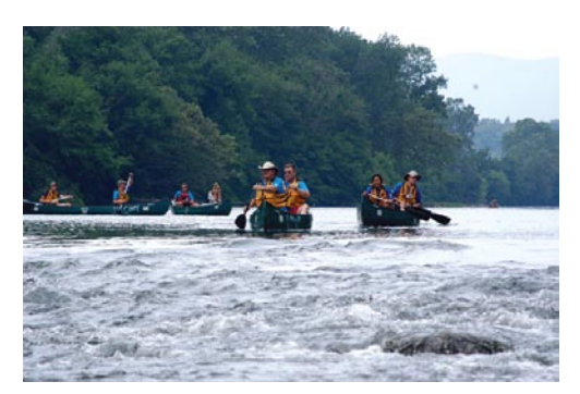
Expedition Chesapeake participants paddle in canoes along the Shenandoah River, a major tributary of the Potomac River.

In Summer 2005, a small group of rural Virginia students embarked on a unique educational journey. Led by the Chesapeake Bay Foundation (CBF), 16 Future Farmers of America (FFA) students from Turner Ashby High School in Virginia's Shenandoah Valley traveled 355 miles by canoe and kayak through farmland and forests, urban and industrial areas, and coastal and open water areas. They started their 30-day journey on the South Fork of the Shenandoah River in Rockingham County, the most intensively farmed county in the state, and ended at Tangier Island, a waterman's village in the middle of the Chesapeake Bay. Like farmers, Tangier residents depend on healthy natural resources to carve out a living. Instead of raising cattle or growing corn, watermen harvest crabs, oysters, and fish from the Bay. The journey, called Expedition Chesapeake, highlighted the connection between the health of the Chesapeake Bay and the quality of water draining from its tributaries, and explored how farmers and others can help reduce nonpoint source pollution.