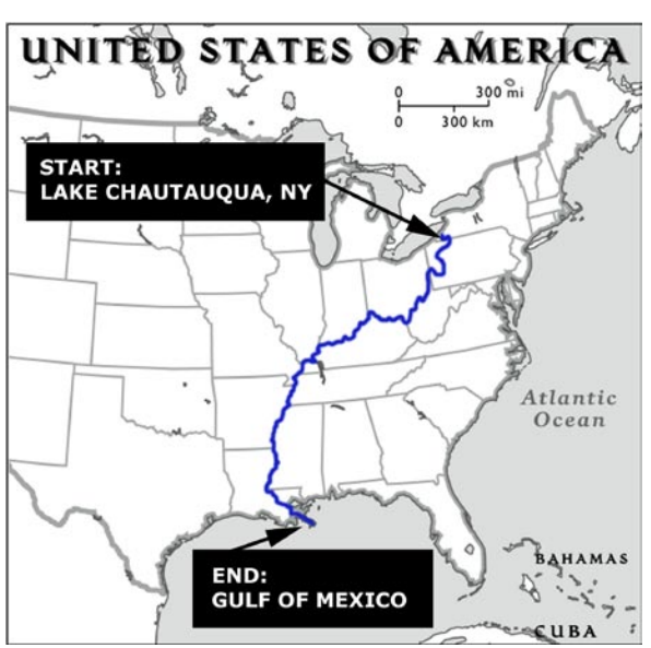
"WaterWorks: A River Journey to the Sea" will take the crew on a water journey across the United States.

In early September 2005, a bicycle-powered pontoon boat set out on a 2,190-mile environmental education journey. The boat and its crew of two are simulating the path of a water drop (albeit a rather large one!) as it moves from Chautauqua Lake in upstate New York, down the Allegheny, Ohio, and Lower Mississippi Rivers, and finally into the Gulf of Mexico. The vessel is stopping at schools and museums in towns along each river to teach people about the importance of water and watersheds, and to make people aware of the origins and destinations of the water that they use on a daily basis. The journey's organizers expect the trip to conclude in early January 2006 after more than four months of river travel.