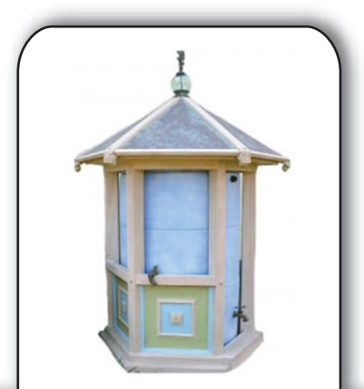
Rain barrels as art . . See article on page 20.

The National Environmental Education & Training Foundation (NEETF) is partnering with the American Meteorological Society (AMS) and others on a program called "Eyes on the Environment," which emphasizes the close connection between weather, watersheds, and the environment. The partners developed the project idea in response to research that NEETF conducted in 2000. The research indicated that the general public had little awareness of environmental issues, and that the information gap between scientists and the public