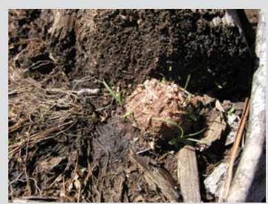
Seedball sprouts after a rain.

hold together in a ball, but not so sticky that it adheres to hands. A pinch of the mix is rolled between the hands to form a sphere about ¾ inch in diameter. The rolled seed balls are air-dried and then stored until ready for distribution.