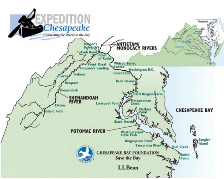
Students on Expedition Chesapeake watched the character of the watershed change as they progressed from the headwaters of the Shenandoah River to Tangier Island, located in the open waters of the Chesapeake Bay.

While on the journey, students investigated connections between land use and water quality and monitored pollution levels, dissolved oxygen, biodiversity, and other indicators of ecosystem health. The National Oceanic and Atmospheric Administration provided the group with a sophisticated water quality probe, which the group towed behind one of the boats. The water quality probe, nicknamed "Margaret" by the students, analyzed the water every three minutes and beamed a signal to a satellite every 30 minutes. The data was then placed on the Expedition Chesapeake Web site as soon as possible—providing an almost real-time look at the water quality during the