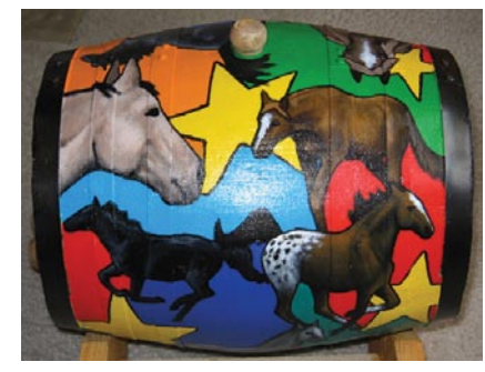
In 2005, some artists also painted decorative, non-functioning rain barrels to display at businesses that lacked room for large rain barrels. "Fun with Horses" reflects Kentucky's close association with the horse.

In the summer of both years, Bluegrass PRIDE sold the decorated rain barrels at auction. The first year, Bluegrass PRIDE held its bi-annual awards meeting, followed by an evening silent auction of the rain barrels. Both events were open to the public and advertised through local media. That year, the silent auction raised $5,000—enough to pay for an AmeriCorps student to help Bluegrass PRIDE work with the local schools for the 2004-2005 academic year.