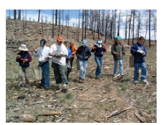
Students drop seed balls in the burned area.

During the project period, volunteers created 100,000 more seed balls than VTF had estimated it would need to cover the 40-acre demonstration site. Even now, some volunteers continue to contribute seed balls, adds Martin. "Many groups that volunteered to make seed balls in 2002