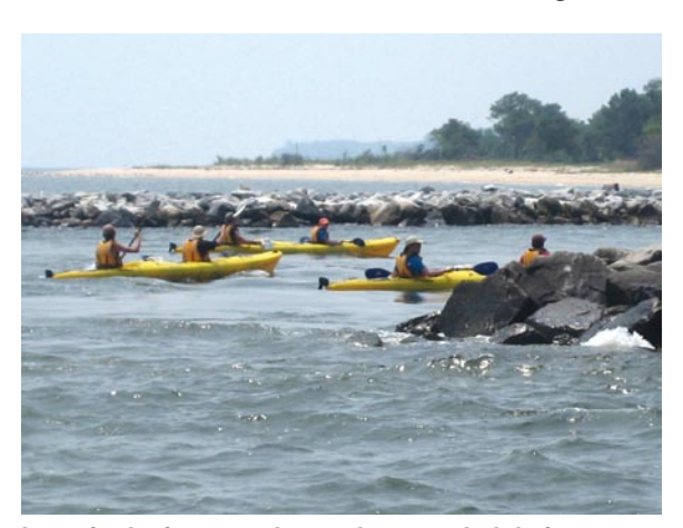
Later in the journey, the students traded their canoes for kayaks as they tackled the wider, deeper waters of the Potomac River and Chesapeake Bay.

CBF also hoped that the media coverage about the journey would help raise awareness of the value of productive farms and healthy waterways, and inspire interest and awareness of the Chesapeake Bay and its tributaries as tremendous and diverse recreational resources. To that end, CBF retained the services of a public relations firm to heavily promote and market the journey in advance and throughout the trip. As a result, the journey received significant local, regional, and national TV coverage, and was featured in many newspaper and newsletter articles. L.L. Bean, which contributed partial funding for the program, included an article about Expedition Chesapeake in its summer catalog.