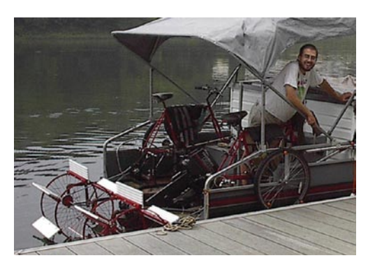
River WaterWorks' unusual bicycle-powered pontoon boat is sure to attract attention during its 2,190-mile journey.

The two-person crew is stopping frequently at communities along the river to present an interdisciplinary watershed education program. The program, which includes a mixture of science, history, social studies, language arts, and music, is designed to meet the National Education Standards for fourth graders. The education program defines and illustrates the concepts of watersheds, groundwater, and conservation. To add a touch of the rivers' historical culture, the crew talks about and plays traditional river music. So far the presentations have been very successful, says Simmons, who serves as boat captain and project leader. "The audiences are responding well—they are interested in the material and seem to be having fun."