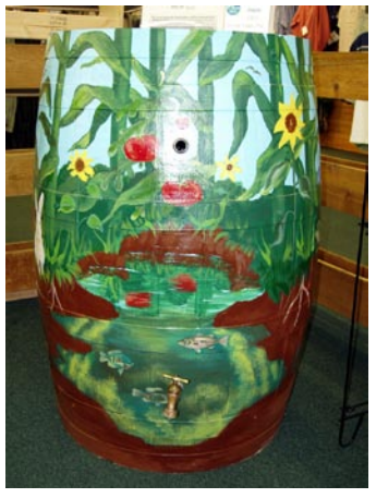
The whimsical "Gazebo," created by two local artists, won first prize in the 2005 rain barrel competition. The runner-up, "Healthy Water, Healthy Planet," shows a high school group's interpretation of the interconnectedness of our environment.

rain barrel program, described stormwater pollution, and illustrated how people could reduce their contributions to nonpoint source pollution. The brochures also invited readers to visit Bluegrass PRIDE's Web site to view all of the decorated rain barrels and to vote for their favorite. Once at the Web site, viewers had access to even more information about nonpoint source pollution prevention.