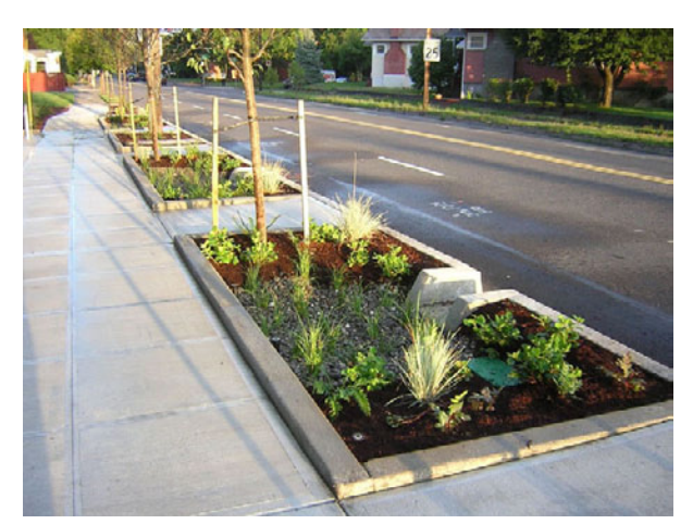
Figure 7. These stormwater planters at a shopping area use all available space between the sidewalk and the street for stormwater control.

"These projects have been very successful," explains Emily Hauth, of the BES Sustainable Stormwater Program. "The residents like both the look of the extensions and the way the narrowing of the street has calmed traffic. The general public is also taking notice. In fact, residents from more than 30 other city neighborhoods have asked for landscaped extensions on their streets." Ms. Hauth adds that the city will try to accommodate these requests as project planning and funding allow.