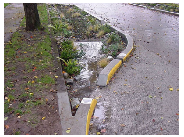
Figure 5. Water flows into the Siskiyou Street curb extension during a rainstorm.