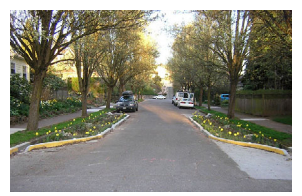
Figure 4. The landscaped curb extensions on Siskiyou Street improve aesthetics, calm traffic, and capture and infiltrate runoff from the street.

BES installed the first project of this type on NE Siskiyou, a residential street. Completed at a cost of $15,000, the two Siskiyou curb extensions converted about 590 square feet of pavement to landscape, and capture runoff from approximately 9,300 square feet of paved surfaces. Monitoring of the Siskiyou project shows that the features capture and infiltrate a large proportion of the runoff. More project information, including monitoring data, is available at www.portlandonline.com/bes/index.cfm?c=37592. BES was so pleased with the effectiveness of these landscaped curb extensions that they have completed two similar projects—and more are planned. Fortunately, the curb extensions can be easily modified for different street configurations (see Figure 6).