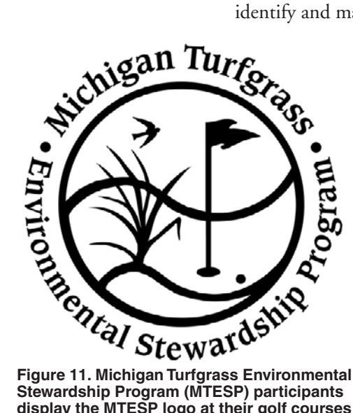
Figure 11. Michigan Turfgrass Environmental Stewardship Program (MTESP) participants display the MTESP logo at their golf courses and on promotional materials.

Many courses use their "Certified Environmental Steward" status as part of their marketing package (see Figure 11). For example, the 900+ acre Grand Traverse Resort and Spa, in Acme, Michigan, plans to highlight its certification in newsletters, in correspondence to the resort's private condominium owners, and at