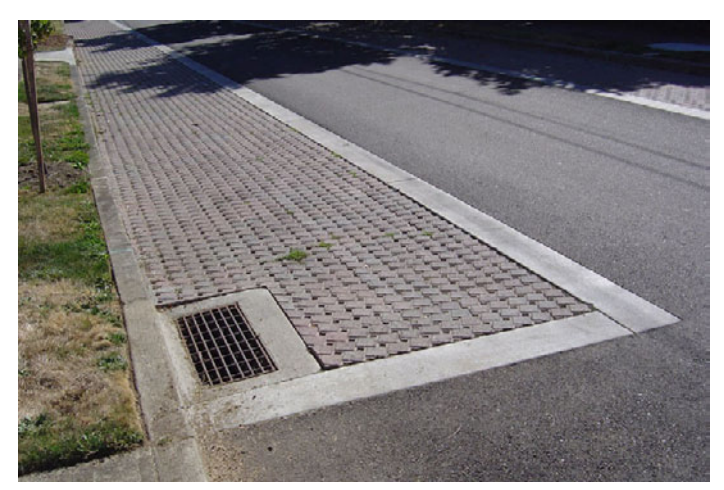
Figure 9. The curb lanes of Westmoreland Street were retrofitted with interlocking concrete block pavers. Excess stormwater not captured by the permeable pavement will overflow into existing stormdrain inlets, such as the one pictured here.

2.2 million gallons of runoff from the combined sewer annually. BES had planned to collect monitoring data, but has run into difficulty doing so, explains Fancher. "We had intended to collect grab samples of the stormwater moving through the pavement, but we've found that the water infiltrates so quickly—even in the biggest storms—that none backs up into the underdrains." Fancher expects to have some monitoring data to report by 2007. In the meantime, monitoring information for most of the other sustainable stormwater projects is already posted on the BES Web site.