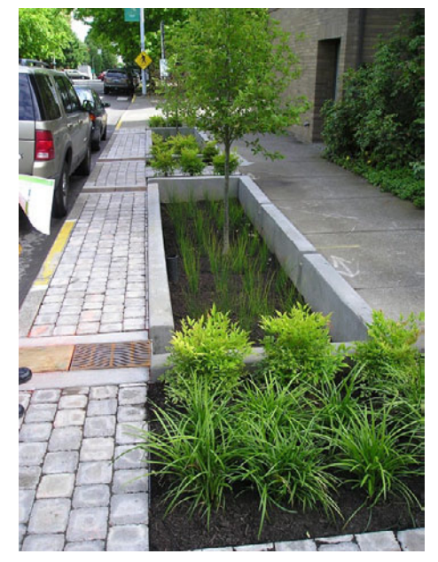
Figure 8. Another of the City's stormwater planter systems, installed next to a parking lane, includes a path of pervious block pavers for pedestrian access.