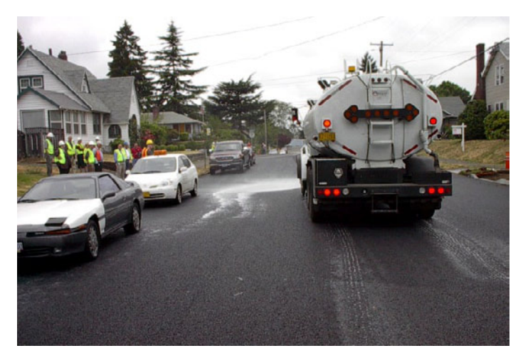
Figure 10. Water sprayed from a truck quickly infiltrates through the new curb-to-curb pervious asphalt section of North Gay Avenue.

The previous pavement pilot project cost more than a conventional paving project, but the city expected that, explains Bob Cynkar, BES Community Outreach Representative. "Pilot projects typically cost more because of initial design costs and the use of less-common materials." Paving four blocks of North Gay Avenue with porous asphalt and concrete cost about $240,000, while the same project using conventional materials would cost about $156,000. "However, we see porous pavement as having a large potential for future use," he adds. "One advantage of using porous pavement as part of a stormwater management plan is that additional real estate is not needed—you just use the road itself." In the long term, Portland expects that the small sustainable stormwater projects like the porous pavement, stormwater planters, curb extensions, and others will ultimately significantly reduce the cost of collecting and treating stormwater runoff. Additional information about this and other projects is available at www.portlandonline.com/bes/index.cfm?c=34598.