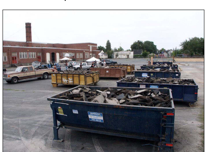
Drop boxes full of asphalt await transport to a local recycling facility.

At another 2009 event, more than 100 people turned out on a hot day in August to help remove 15,000 square feet of blacktop at Vestal School. Volunteers from Depave, Vestal School and Friends of Portland Community Gardens worked to remove the pavement and then turned the project over to Vestal School and the Friends of Portland Community Gardens. The partners transformed the site into a large community garden (see <a href="http://vestalcommunitygarden.blogspot.com">http://vestalcommunitygarden.blogspot.com</a>), which officially "opened for growing" in March 2010. The 2009 Vestal School depaving project builds on a similar project at Vestal the previous year, when the Vestal School parents and students removed approximately 15,000 square feet of blacktop and created a soccer field, school arboretum and sitting area. The Vestal School projects were funded primarily by