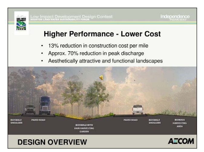
Figure 1. This graphic shows the winning design concept for the green roadway project.