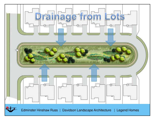
Figure 3. This graphic shows one of the winning elements of the suburban residential project design.