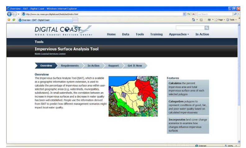
The first page of the Impervious Surface Analysis Tool (ISAT) provides a road map for using the tool, including tabs with overview information, the technical and data requirements for using ISAT, examples of ISAT in action, online ISAT help and tutorials, and how to download ISAT.