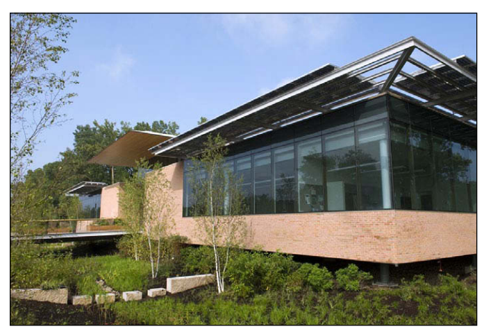
The rainwater glen wraps around the Plant Science Center.

The Chicago Botanic Garden offers numerous videos about the Plant Science Center's green roof garden and rainwater glen through its Garden Blog Web site (www.chicagobotanic.org/grow). Be sure to check out: