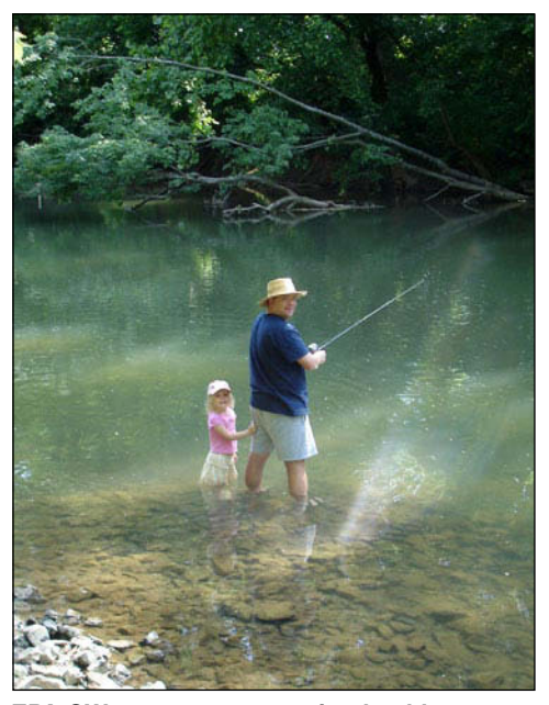
EPA OW promotes protecting healthy watersheds for the benefit of people and the environment.