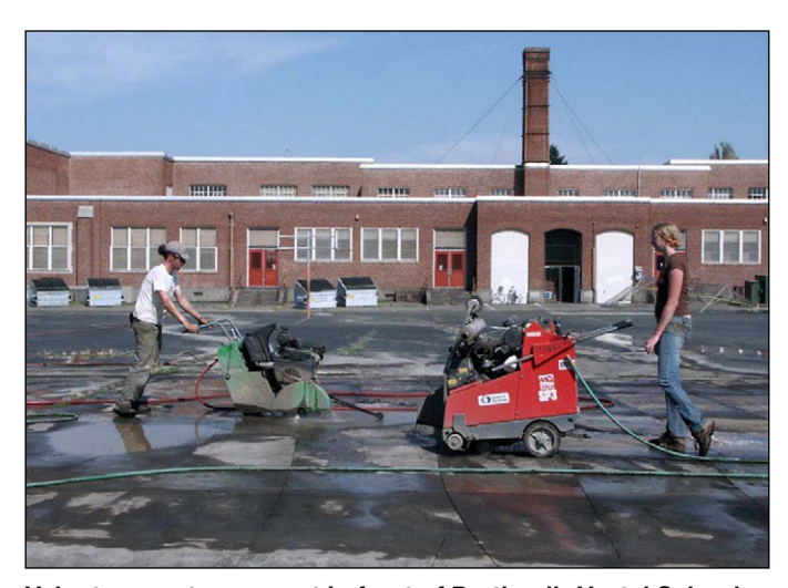
Volunteers cut pavement in front of Portland's Vestal School, the site of a future community garden.

Depave has completed at least 10 depaving projects since 2007, with many additional projects planned for 2010. The group removed 30,000 square feet of pavement in 2009 alone. The group provides an online survey form through which Portland residents may propose particular sites for depaving (see <a href="http://depave.org/blog/how-to-depave">http://depave.org/blog/how-to-depave</a>). The form asks about the location, the dimensions of the site, the type and thickness of the pavement, the property owner's support of the project, the site's rainwater drainage and visibility, and the intended use of the depaved area.