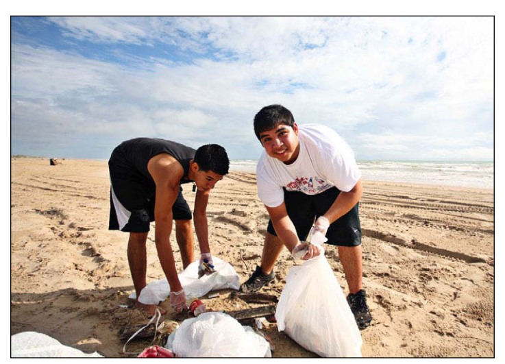
Two volunteers pick up trash on South Padre Island, Texas as part of the 2009 International Coastal Cleanup Day (Photo by Joe Baraban/Aurora).

On September 19, 2009, nearly 500,000 volunteers from around the world spent a few hours removing trash and debris from beaches, lakes and rivers—and they kept track of every piece of