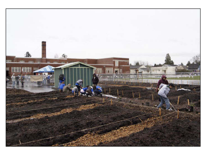
The depayed area at Vestal School is transformed into a new community garden.

At another 2009 event, more than 100 people turned out on a hot day in August to help remove 15,000 square feet of blacktop at Vestal School. Volunteers from Depave, Vestal School and Friends of Portland Community Gardens worked to remove the pavement and then turned the project over to Vestal School and the Friends of Portland Community Gardens. The partners transformed the site into a large community garden (see <a href="http://vestalcommunitygarden.blogspot.com">http://vestalcommunitygarden.blogspot.com</a>), which officially "opened for growing" in March 2010. The 2009 Vestal School depaving project builds on a similar project at Vestal the previous year, when the Vestal School parents and students removed approximately 15,000 square feet of blacktop and created a soccer field, school arboretum and sitting area. The Vestal School projects were funded primarily by