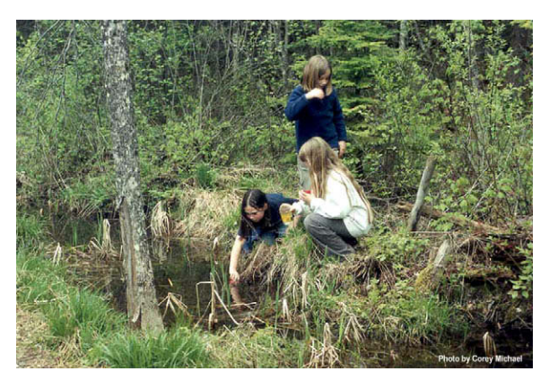
Children take water samples in a wetland.

Looking for some summer reading material for your family? The U.S. Environmental Protection Agency's (EPA's) Wetlands Division offers a comprehensive online wetland reading list for