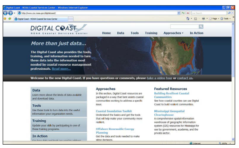
The Digital Coast homepage (www.csc.noaa.gov/digitalcoast) offers links to coastal data, tools, training and on-the-ground examples of how coastal resource managers use the information provided.

The Digital Coast Web site (www.csc.noaa.gov/digitalcoast) contains a variety of free coastal data sets and tools. Data sets are grouped by type, including orthoimagery (aerial photos), elevation, benthic (underwater) terrain, land cover, hydrography, marine boundaries and socioeconomic data. Digital Coast also provides numerous tools to help coastal managers use these and other data sets. The Web page for each tool displays a series of tabs that provide visitors with overview information, technical and data requirements for using the tool, examples of the tool in action, user support information and directions explaining how to download the tool. Tools are grouped by type: