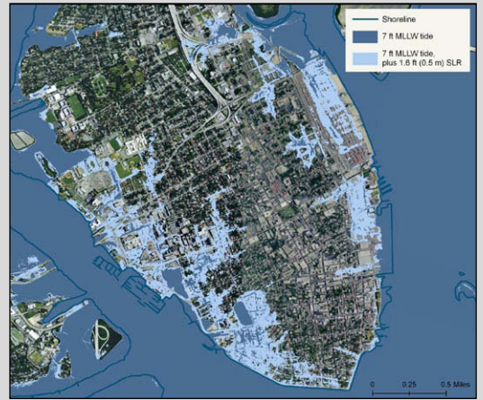
An assessment of Charleston, South Carolina shows the amount of inundation that would occur with both a 7-foot mean lower low water (MLLW) tide—the observed average of the lower low water height of each tidal day—plus an 18-inch sea level rise (SLR).

The toolkit shows coastal managers how to tie together the different Digital Coast resources, such as the County Snapshots tool and CanVis, to assess flooding risks and begin planning for the future.