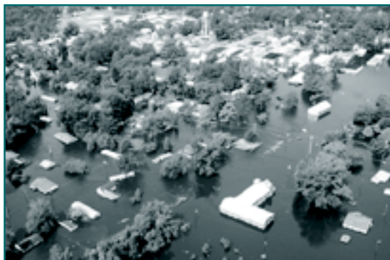
The Great Flood of 1993 in the upper Mississippi River Basin caused billions of dollars in property damage and resulted in 38 deaths. Historically, 20 million acres of wetlands in this area had been drained or filled, mostly for agricultural purposes. If the wetlands had been preserved rather than drained, much property damage and crop loss could have been avoided.

Biological productivity. Wetlands are some of the most biologically productive natural ecosystems in the world, comparable to tropical rain forests and coral reefs in their productivity and the diversity of species they support. Abundant vegetation and shallow water provide diverse habitats for fish and wildlife. Aquatic plant life flourishes in the nutrient-rich environment, and energy converted by the plants is passed up the food chain to fish, waterfowl, and other wildlife and to us as well. This function supports valuable commercial fish and shellfish industries.