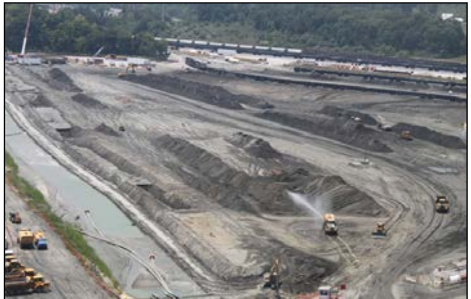
On-site ash dewatering

Phase 1 was an 18-month time-critical removal action that involved mechanical excavation, hydraulic dredging, rapid materials handling, and disposal of 3.5 million cy of ash from the Emory River to alleviate upstream flooding concerns and to mitigate further downstream transport. Ash removed from the river was dewatered on-site and loaded onto rail cars for disposal at the approved Arrowhead Landfill in Perry County, Alabama. Ash removal under the time-critical phase was completed in May 2010 when the Emory River re-opened for navigation and recreation. Railroad transportation and off-site ash disposal were completed in December 2010.