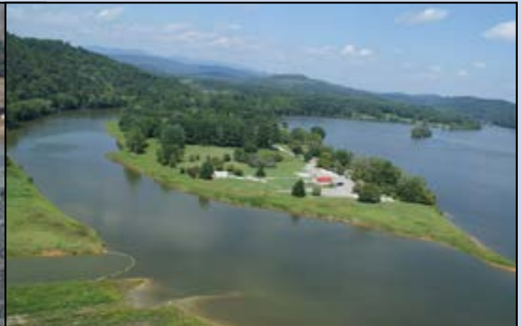
East Embayment now