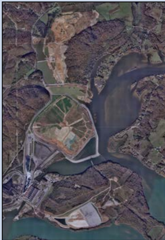
Aerial Photo- November 7, 2014