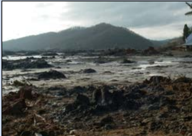
Middle Embayment then