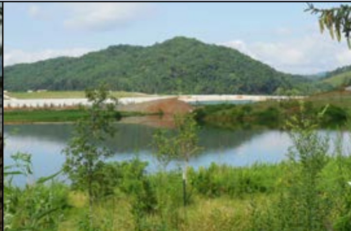
Middle Embayment now