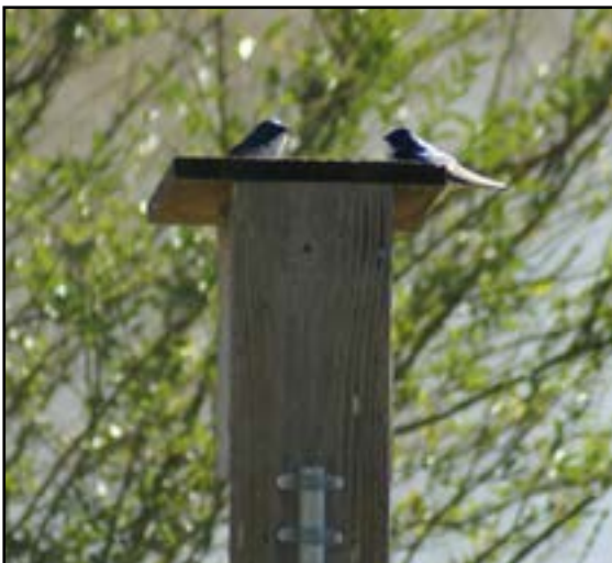
Monitoring ash impact on swallow population

Phase 3 was also a non-time-critical removal action that involved a comprehensive human health and ecological risk assessment of the estimated 500,000 cy of residual ash that was not removed from the Emory River during the Phase 1 time-critical dredging work or was transported downstream during storm events. Independent medical screening by Oak Ridge Associated Universities concluded that there were no adverse health impacts caused by the coal ash spill. Although the study concluded that the pre-existing fish consumption advisories should remain in effect. The ecological risk assessment evaluated twenty measurement endpoints for coal ash-related impacts including six species of fish, four species of birds, and three species of amphibians, three species of turtles, raccoons, mayflies, snails, and aquatic vegetation. Extensive geochemistry studies, sediment and pore water bioassays,