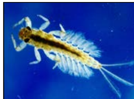
Monitoring ash impact on macroinvertebrate population

natural processes such as mixing, scouring and redeposition, and sedimentation (burial) to reduce the relatively low risks posed to benthic macroinvertebrates (bugs) and to birds that prey on bugs.