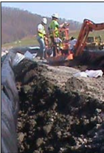
Loading ash onto rail car