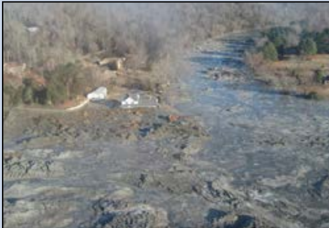
East Embayment then