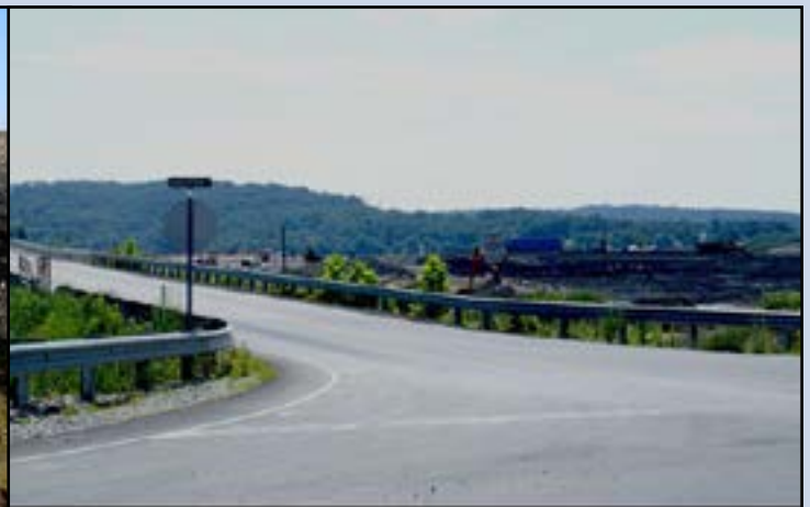
Swan Pond Circle now