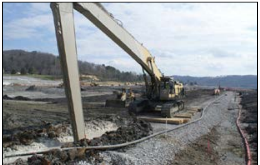
Construction of the slurry wall