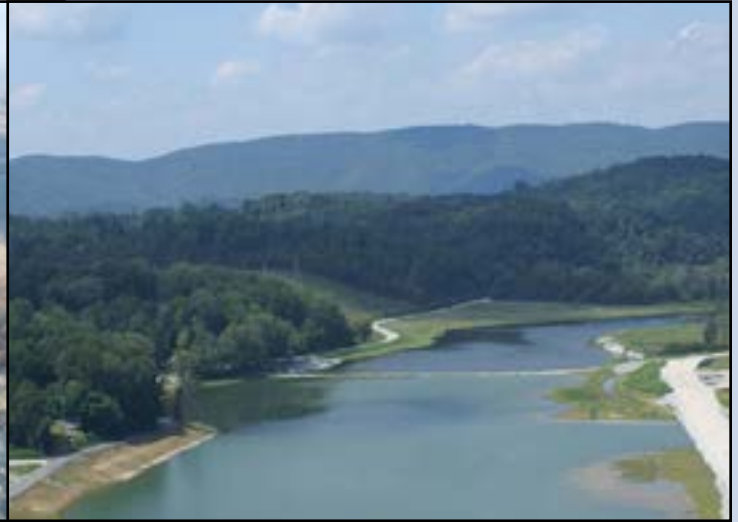
North Embayment now