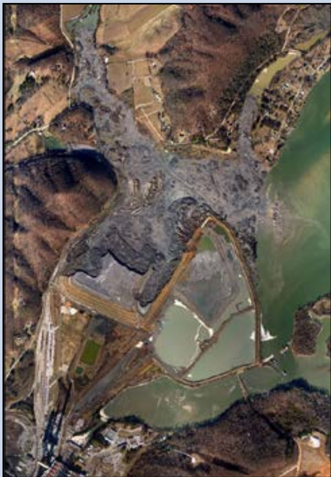
Aerial Photo- December 28, 2008