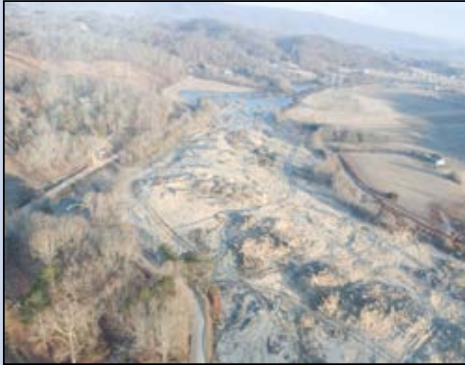
North Embayment then