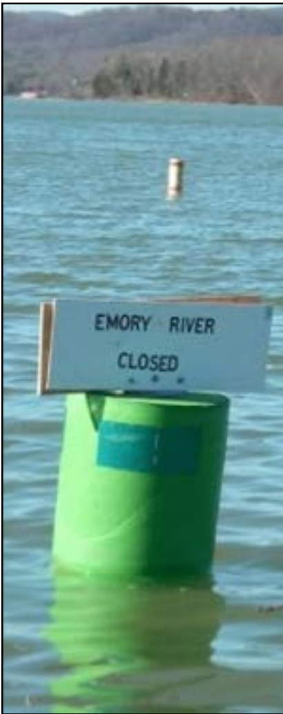
Emory River closed

Phase 1 was an 18-month time-critical removal action that involved mechanical excavation, hydraulic dredging, rapid materials handling, and disposal of 3.5 million cy of ash from the Emory River to alleviate upstream flooding concerns and to mitigate further downstream transport. Ash removed from the river was dewatered on-site and loaded onto rail cars for disposal at the approved Arrowhead Landfill in Perry County, Alabama. Ash removal under the time-critical phase was completed in May 2010 when the Emory River re-opened for navigation and recreation. Railroad transportation and off-site ash disposal were completed in December 2010.