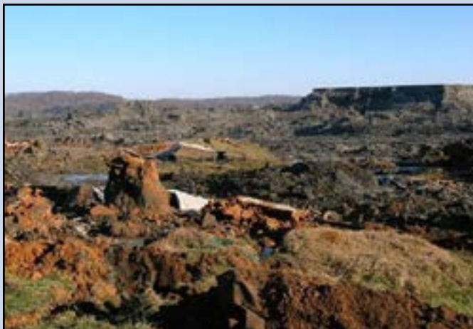
Swan Pond Circle then