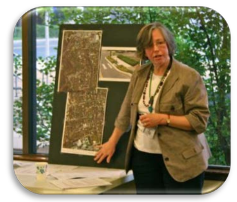
Community Meeting. Several community meetings were held during the process.

In the City's 2012 Watershed Implementation Plan, the retrofit of Flower Avenue as a green street was identified as one of several projects necessary to meet the City's Chesapeake Bay Total Maximum Daily Load (TMDL) goal to retrofit 20% of the City's existing impervious surfaces – such as roads, sidewalks, pavement, and rooftops – with improved stormwater management. Of the 79 retrofit acres necessary to meet the 20% goal, the City had retrofitted 14 acres of impervious area with green stormwater infrastructure by 2012 and had identified an additional 13 acres in credits for existing street sweeping, stream restoration, and tree