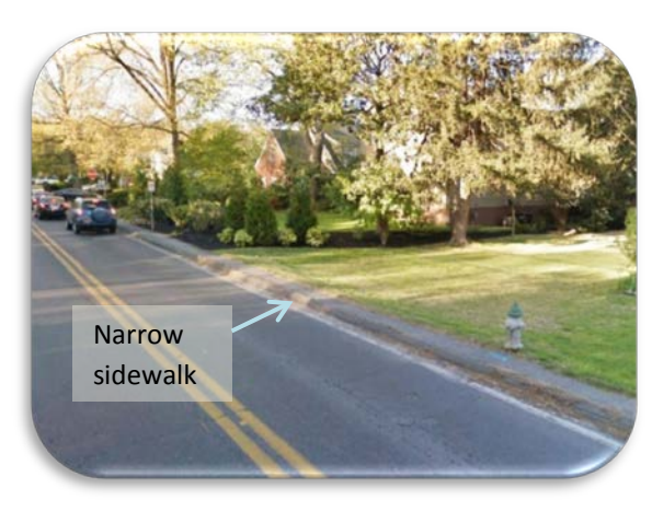
Existing Asphalt Path (east side): Walking on the east side's asphalt path can be dangerous.

The newly acquired portion of Flower Avenue is a two lane road just under a mile long with a posted speed limit of 25 miles per hour. In spite of the lack of continuous sidewalks on the road's eastern side, lack of American with Disabilities Act (ADA) compliant sidewalks on both sides, limited crosswalks, and speeding traffic, Flower Avenue is a popular place for residents to walk. It's also a popular place to catch a bus. There are sixteen bus stops along the corridor: eight in each direction.