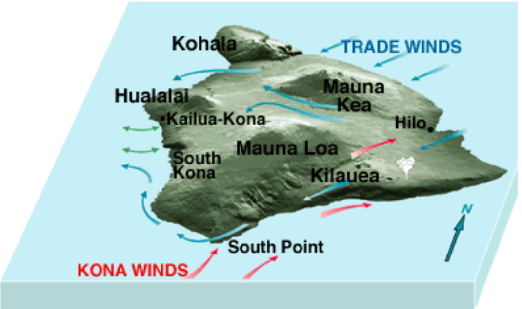
Figure 3: Hawaii County Wind Patterns

Figure 3, provided as part of Hawaii's 2012-2014 SO<sub>2</sub> Exceptional Events package, shows these wind patterns, peaks, and cities on the Big Island of Hawaii.