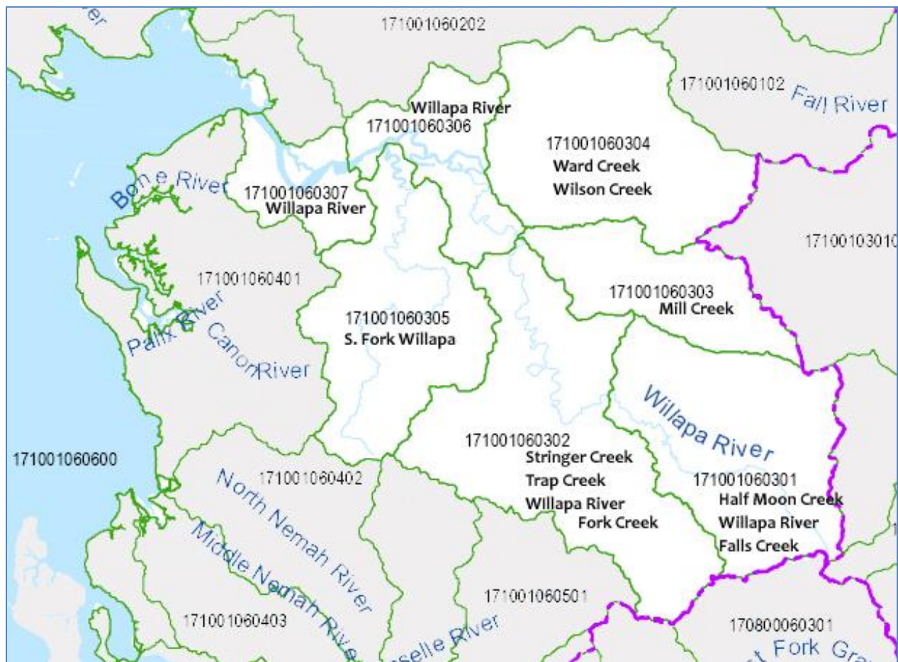
Figure 2. The Willapa River watershed includes 7 HUC-12 level watersheds.

Sources of fecal coliform bacteria in the watershed are both point and nonpoint in nature. Known point sources with permit effluent limits for coliform bacteria are City of Raymond wastewater treatment plant (WWTP) at RM 7.0, South Bend WWTP at RM 3.5, Coast Seafood at RM 3.1, East Point Seafood at RM 4.1 and South Bend Packers at RM 3.5. In general, nonpoint sources of fecal coliform bacteria are failing on-site sewage systems, livestock operations, hobby farms, urban areas, wildlife and recreational uses. The fecal coliform loading from point sources was previously determined to be an insignificant portion of the total bacteria loading to the lower Willapa River.