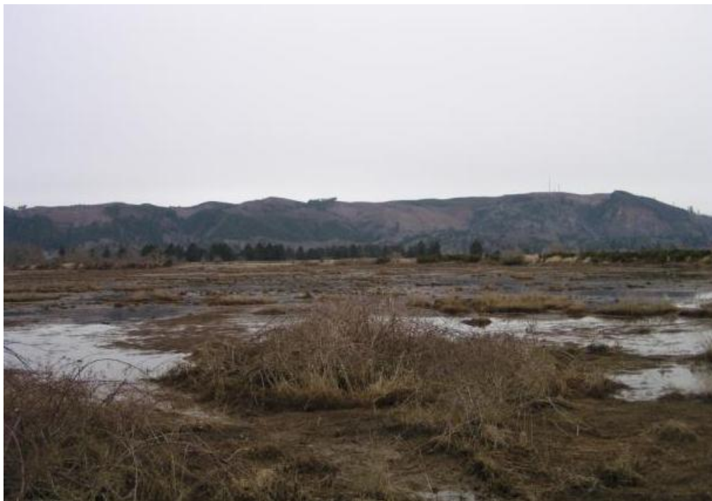
Figure 3. Numerous stakeholders partnered on the Potter Slough Estuary restoration project, seen here after completion.

Multiple landowners and agencies (NRCS, Ducks Unlimited, Washington Department of Fish and Wildlife, Washington State Department of Transportation) partnered on an eight-year effort (2000 to 2008) to restore 300 acres of estuary wetlands at Potter Slough in the lower Willapa River (Figure 3). This area had been diked for almost 100 years. Ecology believes that this restoration work correlates to bacteria reductions seen in 2006 at monitoring station WRSB-1. For this project, six adjacent private landowners applied for the Wetland Reserve Program (WRP) and were granted conservation easements. The landowners sold the fee title on the property to Washington Department of Fish and Wildlife. The WRP funded studies and designs, and then construction activities to restore the estuary and freshwater wetlands. The project required that a portion of a highway be raised—this was funded through the Washington State Department of Transportation. This project area now provides wildlife habitat and has improved water quality by removing pollutant sources. For example, one of the landowners participating in the project kept up to 200 cows on a tideland pasture in Potter Slough until selling the land in 2005.