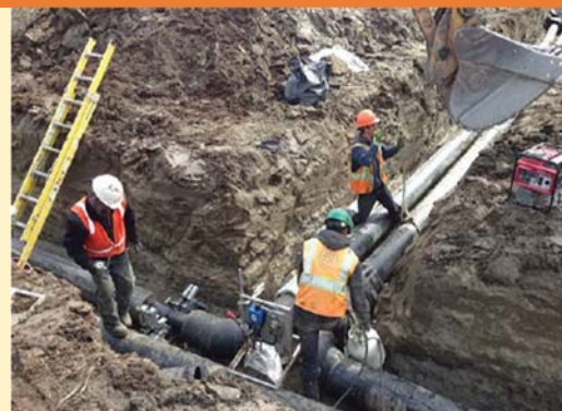
Construction of sewer collection piping in the Kwethluk, Alaska community

Until recently, the Kwethluk Community was the largest underserved community in Alaska, with limited access to drinking water and no wastewater infrastructure. A total of 181 homes lacked access to drinking water and wastewater infrastructure. Community members self-hauled potable water from a central distribution point and disposed of human waste using open buckets that were transferred in collection containers via ATV to a lagoon outside of town. These conditions presented major health risks, as spills were common and contamination was spread throughout the community by rain and airborne dust. In 2009, the ANV program and other partners funded the construction of water source, water treatment facilities, water storage, water distribution, sewer collection, sewer treatment and plumbing to each Kwethluk home. By 2016 this investment will provide in-home access to drinking water and sanitation to this community for the first time, reducing residents' exposure to health risks.