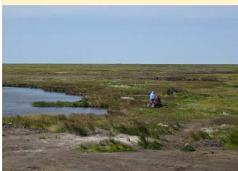
View of typical remote Alaskan arctic tundra with two people on an all-terrain vehicle

When heating is necessary to keep underground pipes from freezing, the high cost of electricity in rural Alaska (up to 50 cents per kilowatt hour) can result in large energy bills. In 2010, local, state and federal partners coordinated in an effort to assist Quinhagak villages in finding affordable, sustainable solutions to combat freezing pipes and high energy costs. With ANV funds, EPA, Alaska Energy Authority, and the State of Alaska collaborated to construct a system to use excess energy from generators to save money when heating pipes. Typically, diesel generators are used to provide electricity in rural Alaska, as the heat from generators gets blown through and out in a similar fashion as a radiator. Waste heat from generators is then used to circulate the excess heat through piping systems to prevent freezing due to the permafrost. This solution has resulted in a sustainable method of re-use, which is cost-efficient for the village community.