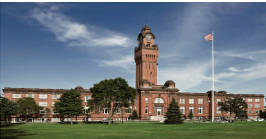
Naval Station Great Lakes — “The Quarterdeck of the Navy.”

NSGL took an aggressive and multi-faceted approach to raising its diversion rate. Active participation of employees and trainees to maximize collection and minimize contamination of recyclables by trash was critical. NSGL worked to carefully tailor its communication to a military audience, educating on the importance of recycling as it related to domestic and foreign policy. In addition, NSGL asked their recycling and composting vendors to track and report tonnage of material produced at each collection point. This encouraged a friendly competition for increasing recycling and food waste tonnage collected among areas of the facility. Along with collecting food waste for composting from the five galleys (cafeterias), NSGL switched to using biodegradable plates, cutlery and napkins to further reduce materials sent to a landfill.