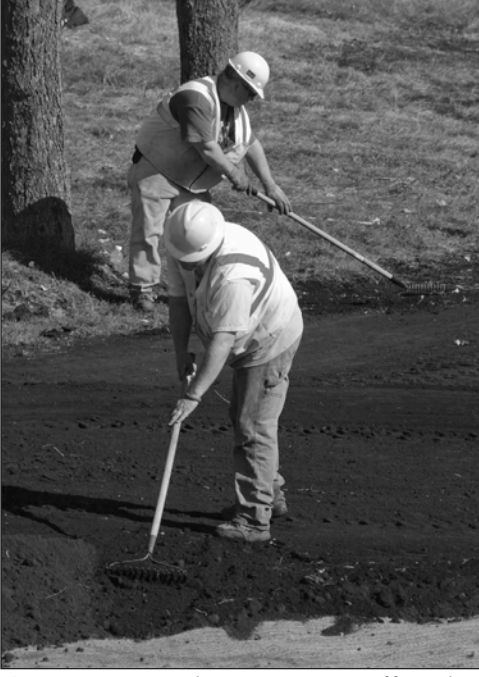
Contractors work to restore an affected area along Talmadge Creek.