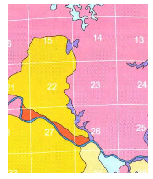
Figure 2.4. Presettlement Vegetation (pink area represents oak-hickory forest)

During the 1990's, strong growth pressures in Ann Arbor resulted in the development of additional hotels, commercial centers, office buildings and