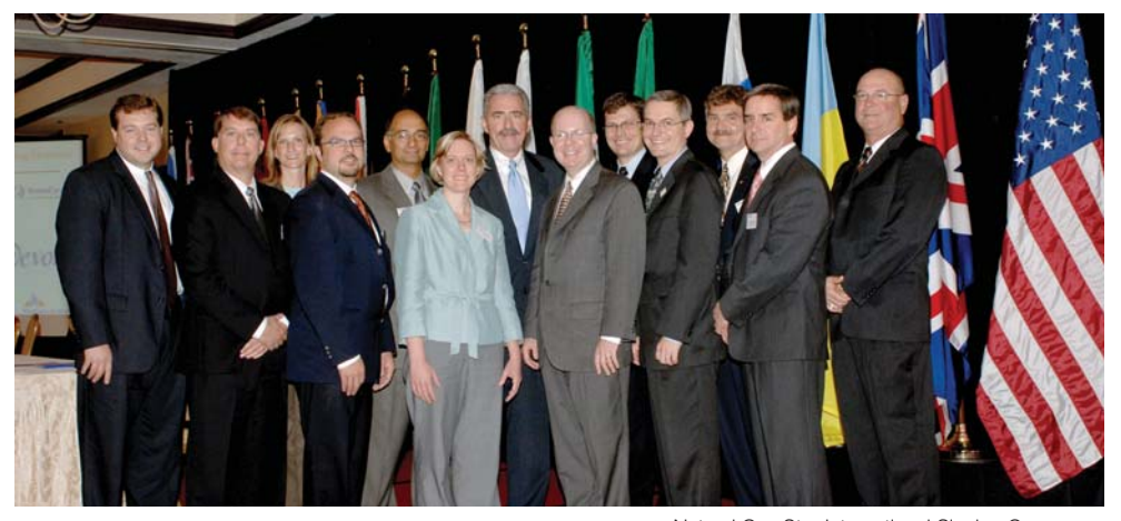
Natural Gas Star International Signing Ceremony.

Further information is available online at epa.gov/gasstar/international.htm.