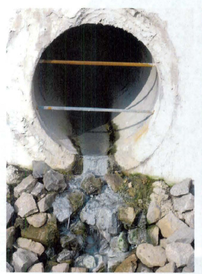
EPA NE Bacterial Source Tracking Protocol – Attachment 1 Stormwater Outfalls With Indicators of Illicit Discharges