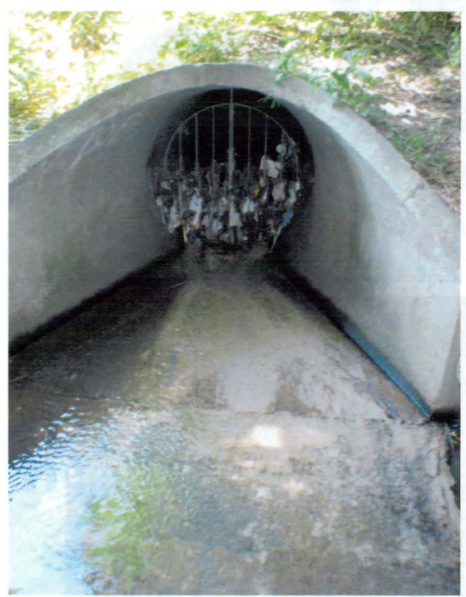
Note off-white filamentous bacterial growth