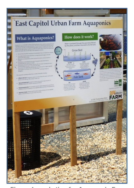
Figure 4: marketing for Aquaponic Farm in the District of Columbia

Use Worksheet # 11 (Pricing) to document information about your approach to pricing. Complete a worksheet for each market segment.