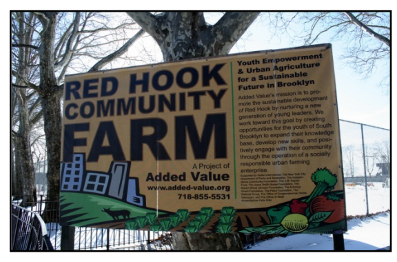
Figure 3: Example Urban Farm Marketing Data

Defining a strategy for marketing and sales is the most important part of your business plan. If a market does not exist or if a workable approach for getting your product to the market has not been identified, you will not meet your goals or expectations. The development of your marketing strategy will require an understanding of the market, including the demand for your product, the potential customers, and the potential competitors. In developing a marketing strategy, you need to convince yourself, as well as the reader of the business plan, that there is a viable market for your product. The marketing strategy is divided into seven sections: