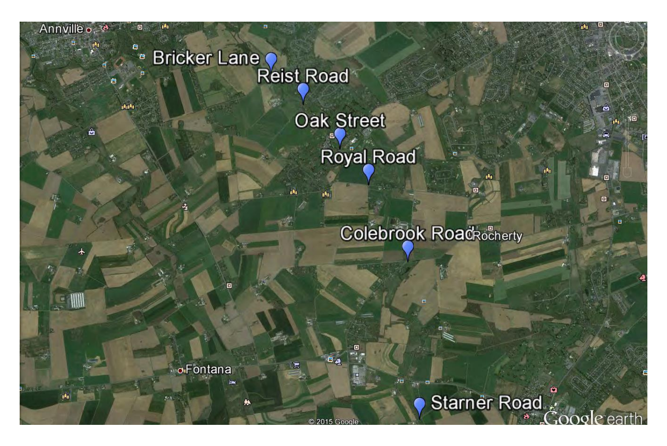
Figure 2: Beck Creek Watershed Ambient Water Quality Sampling Locations

Ambient sampling locations were selected by EPA Region 3, and locations were selected to provide samples that were representative of background conditions within the watershed. Some ambient sampling locations are located at or near an AFO involved in this assessment. Samples were collected at all ambient locations on the same day to ensure comparability of environmental and weather conditions among the ambient samples. The sampling team photographed each ambient sampling location. Photographs were taken to document the sample location, and to document indicators of bed, bank, and ordinary high water mark (OHWM) at each location.