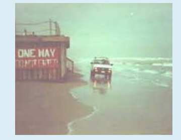
An eroded beach on North Padre Island impairs public access along the shore.

Tropical storms and hurricanes have become more intense during the past 20 years. Although warming oceans provide these storms with more potential energy, scientists are not sure whether the recent intensification reflects a long-term trend. Nevertheless, hurricane wind speeds and rainfall rates are likely to increase as the climate continues to warm.