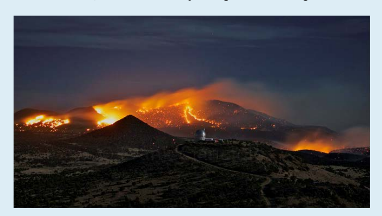
The 2011 drought contributed to widespread wildfires in Texas, like this one behind the McDonald Observatory near Fort Davis.

The combination of more fires and drier conditions may expand deserts and otherwise change parts of the Texas landscape. Many plants and animals living in arid lands are already near the limits of what they can tolerate. A warmer and drier climate would generally extend the Chihuahuan desert to higher elevations and expand its geographic range. In some cases, native vegetation may persist and delay or prevent expansion of the desert. In other cases, fires or livestock grazing may accelerate the conversion of grassland to desert in response to the changing climate. For similar reasons, some forests may change to desert or grassland.