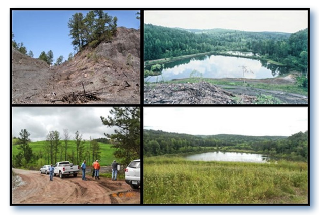
Figure 2. Watershed sites before (in 2006, top) and after (in 2011, bottom) restoration occurred.