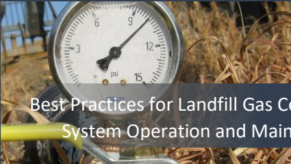
Best Practices for Landfill Gas Collection System Operation and Maintenance