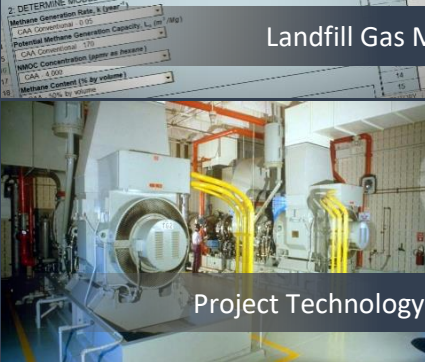
Project Technology Options