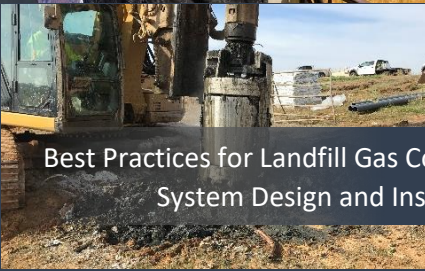
Best Practices for Landfill Gas Collection System Design and Installation