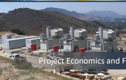
Project Economics and Financing