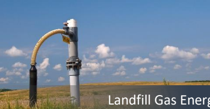
Landfill Gas Energy Basics