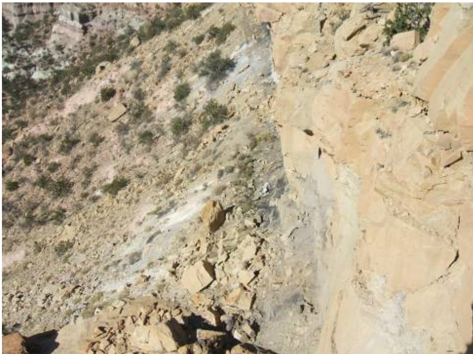
Photo 2. Mine site from top of cliff area, towards the west