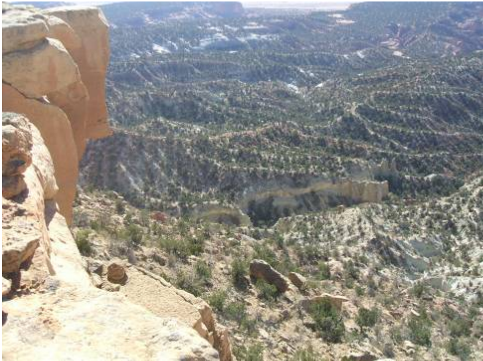
Photo 1. Mine site from top of cliff area, towards the south/southeast