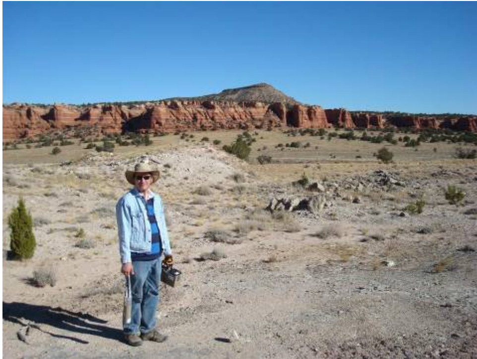
Photo 3. Glover Mine site, towards the north