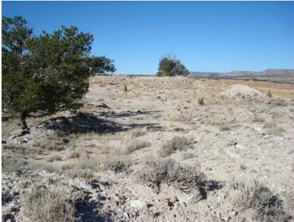
Photo 1. Glover Mine site, towards the south