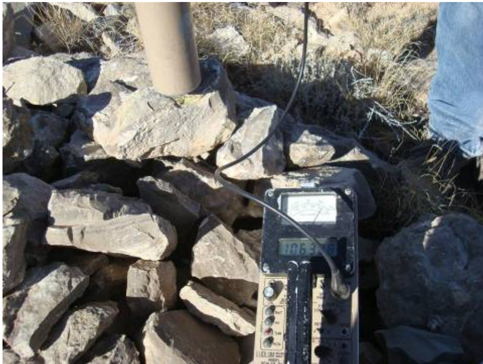
Photo 4. Glover Mine site, waste rock piles