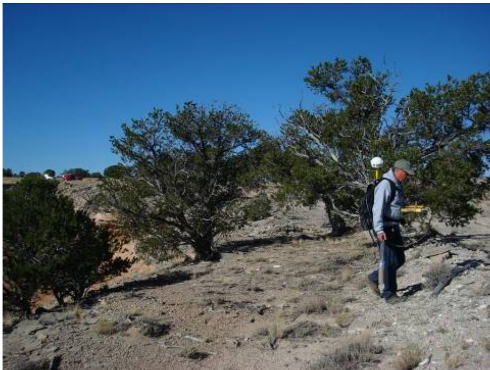
Photo 2. Glover Mine site, towards the west