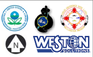
Gamma Radiation Measurements Above Two Times Background Section 29 - Conoco Crownpoint Chapter Navajo Nation, New Mexico Figure 1