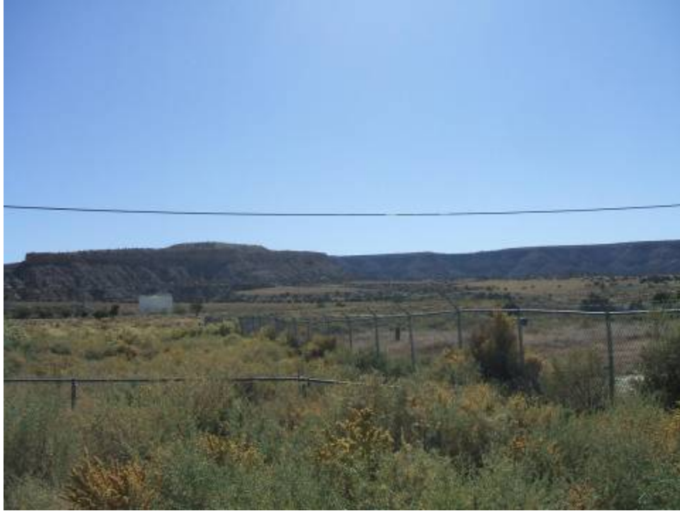
Photo 3. Crownpoint ISL mine site, towards the south