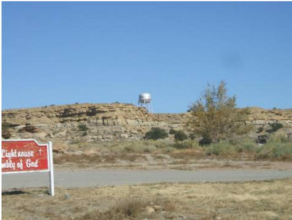
Photo 8. Water tower approximately 0.5 miles north/northeast of site, towards the northeast