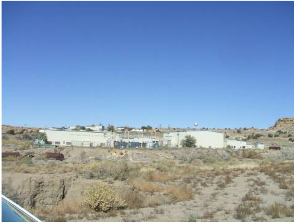
Photo 7. Crownpoint ISL mine site and Hydro Resources building, towards the north