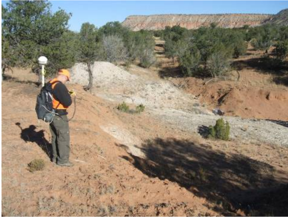
Photo 1. Section 22 mine site and gravel pile and ditch, towards the northwest