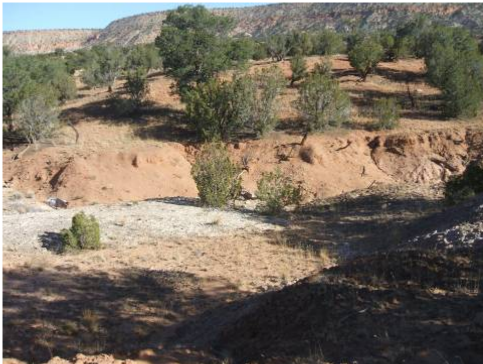
Photo 2. Section 22 mine site and gravel pile and ditch, towards the northeast