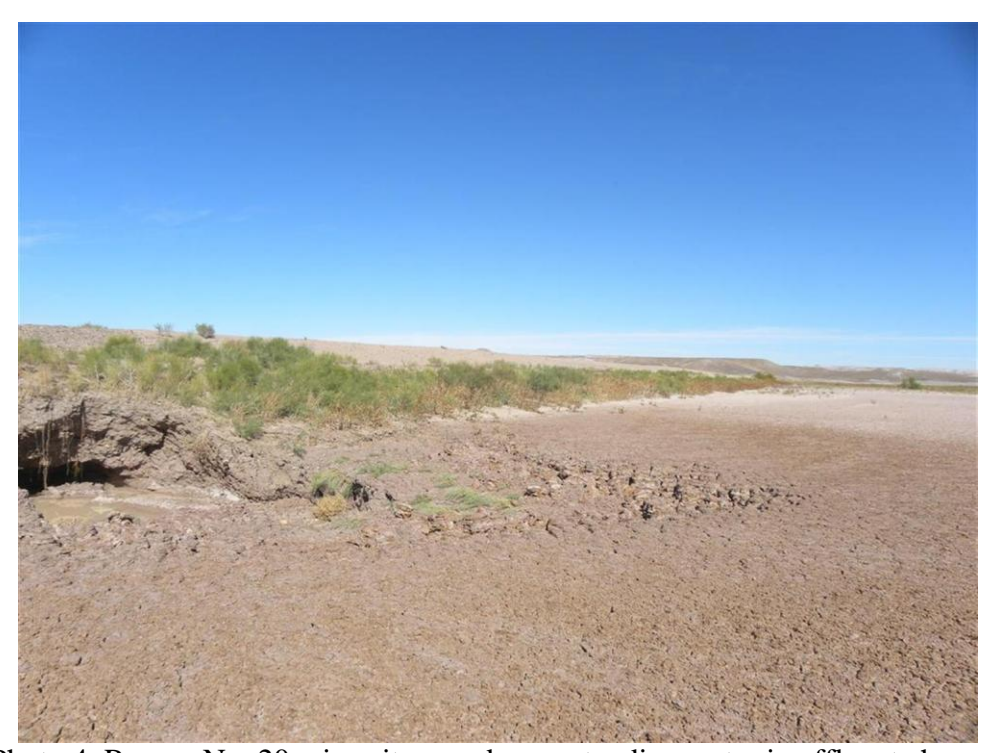
Photo 4. Ramco No. 20 mine site, pond area, standing water in effluent channel