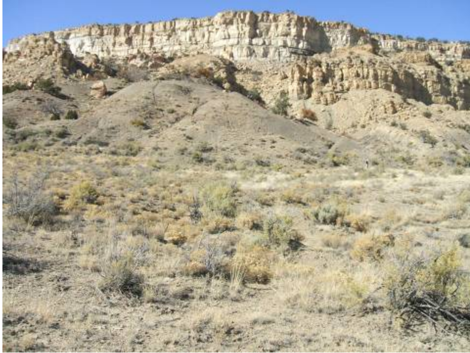
Photo 3. Section 13 mine site, towards the north