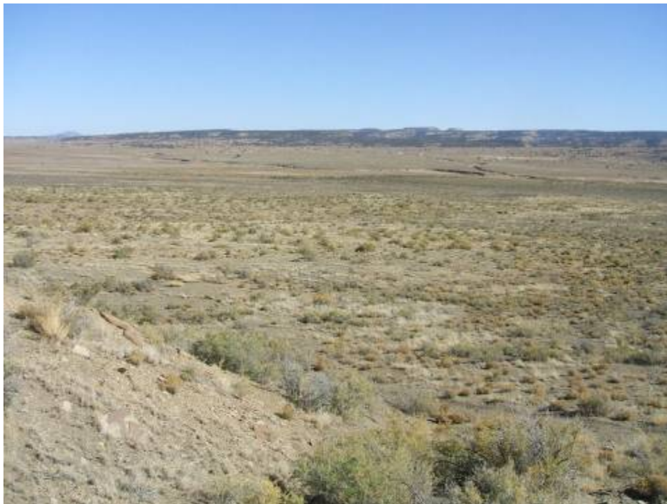
Photo 2. Section 13 mine site flat area, towards the south