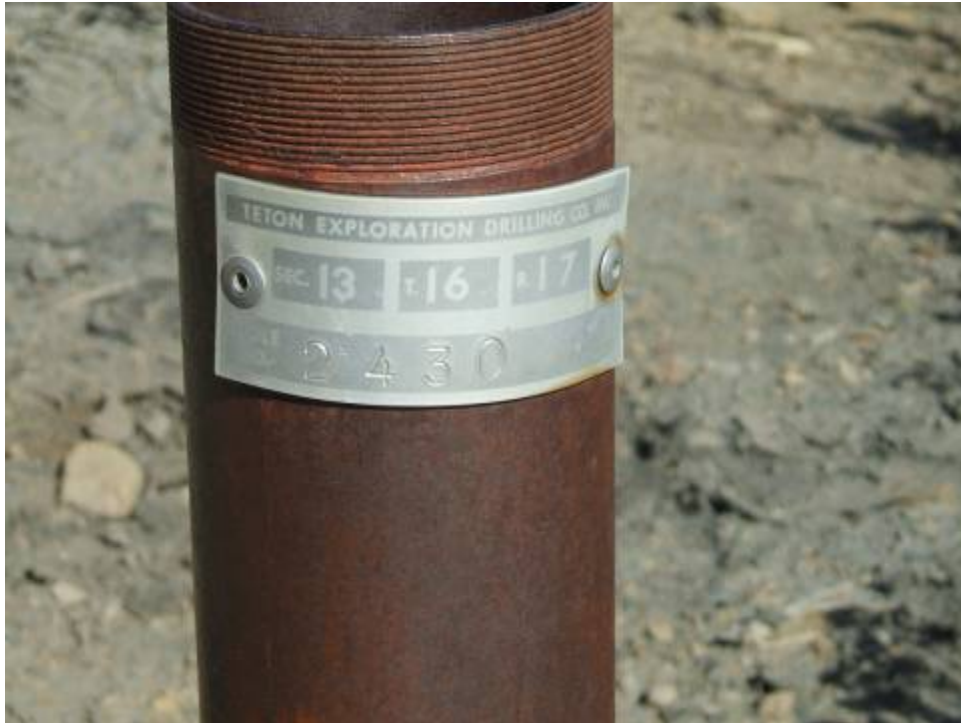
Photo 5. Section 13 mine site well, towards the east