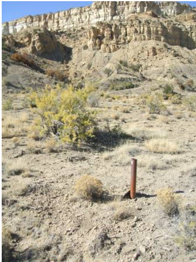
Photo 4. Section 13 mine site well, towards the north