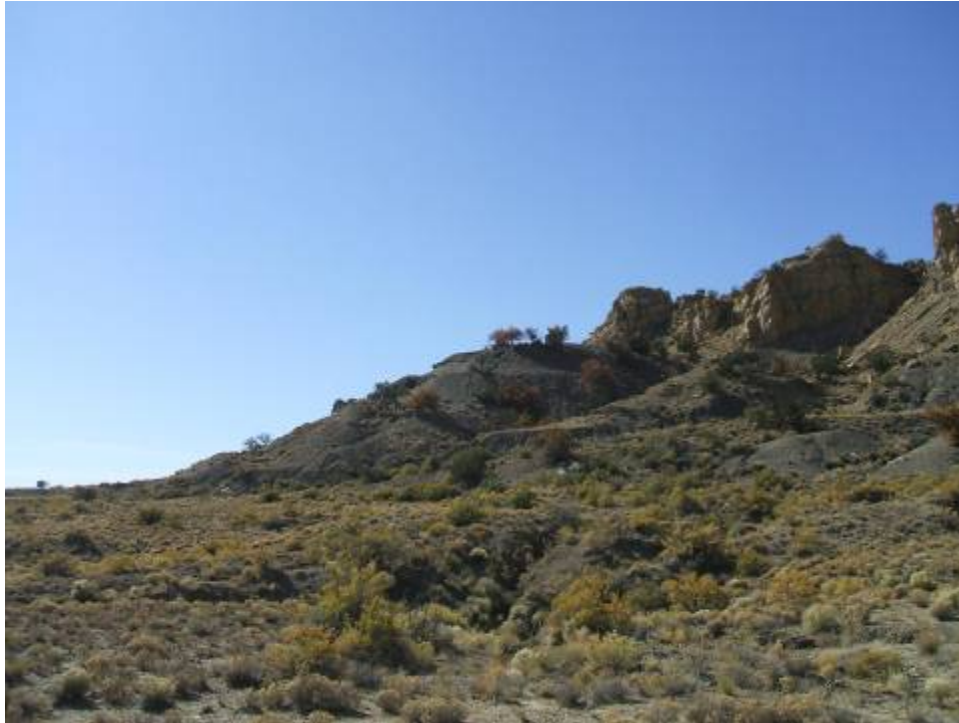
Photo 1. Section 13 mine site hill side, towards the west