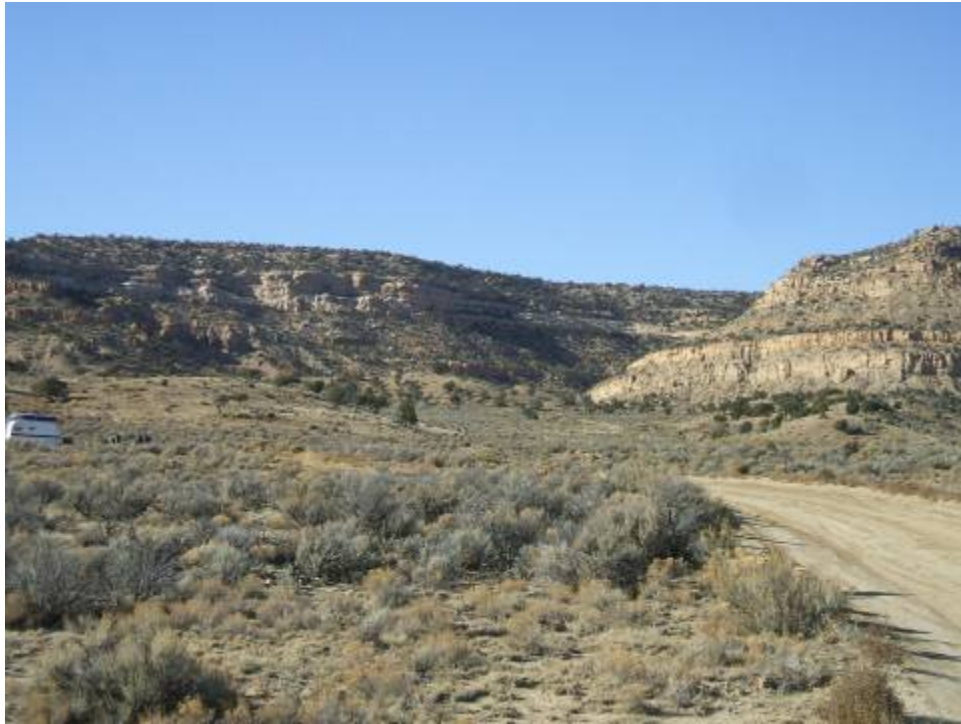
Photo 1. Grace Insitu Leach mine site in the distance, towards the northwest