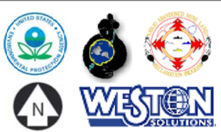
Gamma Radiation Measurements Grace Insitu Leach Church Rock Chapter Navajo Nation, New Mexico Figure 2