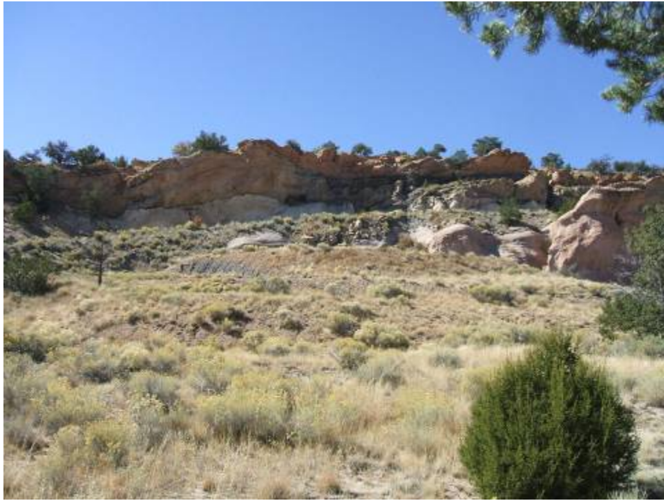
Photo 1. Diamond No 2 mine site, slope and cliff area, towards the west