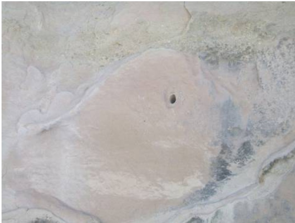
Photo 4. Diamond No 2 mine site, possible blasting hole on the cliff wall, towards the west