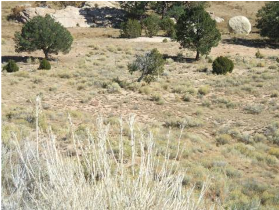
Photo 2. Diamond No 2 mine site, flat area, towards the east