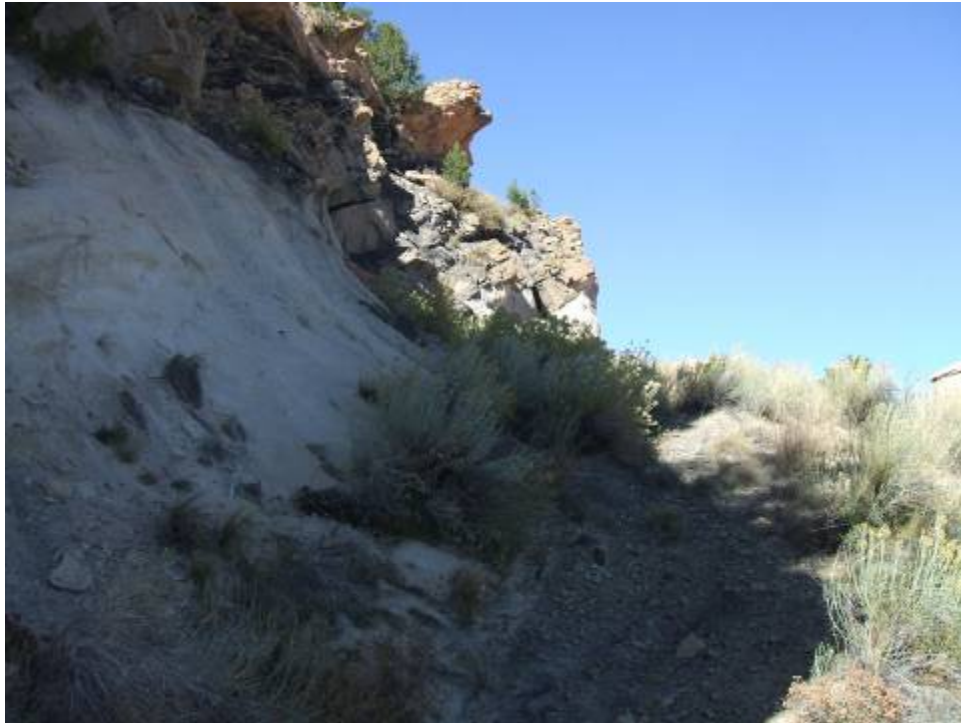
Photo 3. Diamond No 2 mine site, cliff wall area, towards the north