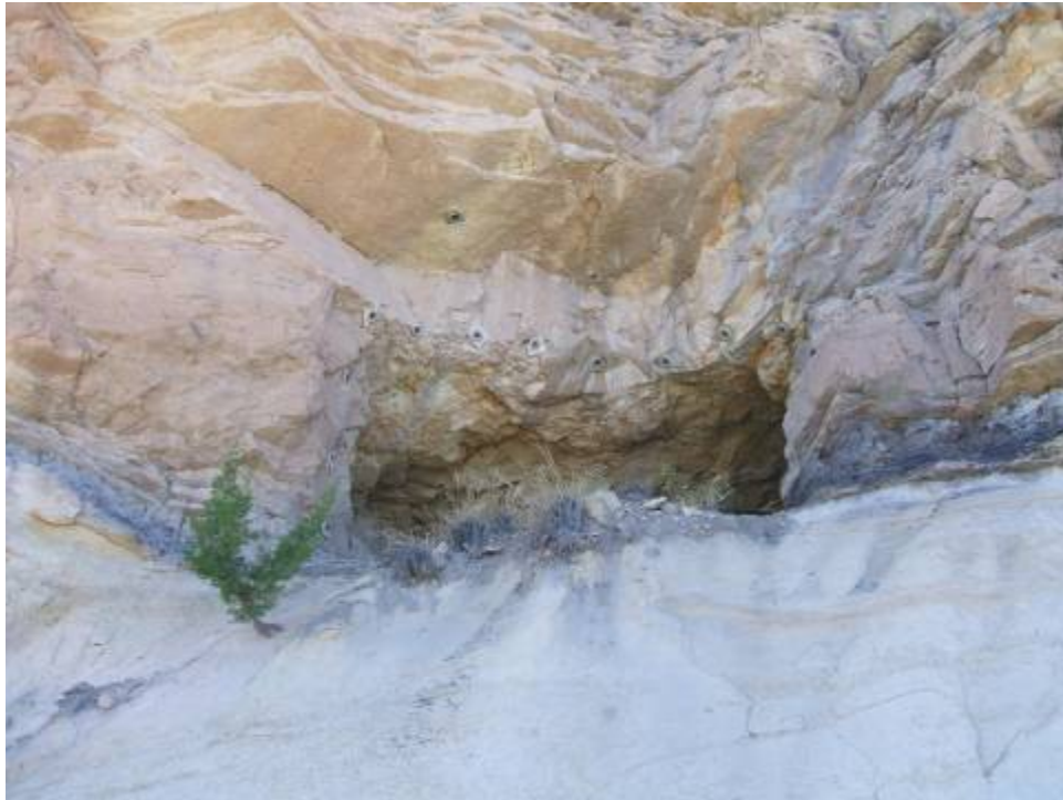
Photo 5. Diamond No 2 mine site, adit / shaft entrance in cliff wall, towards the west