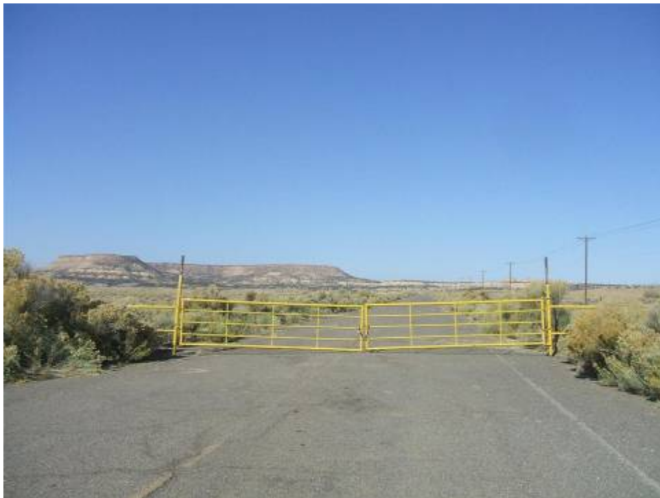
Photo 2. Locked gate on road leading towards Kermac No. 24 mine site