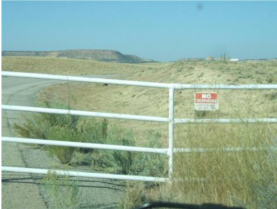
Photo 1. Locked gate on road leading towards Kermac No. 24 mine site