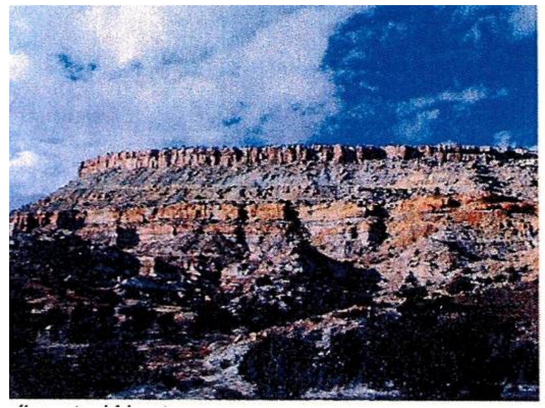
View to west