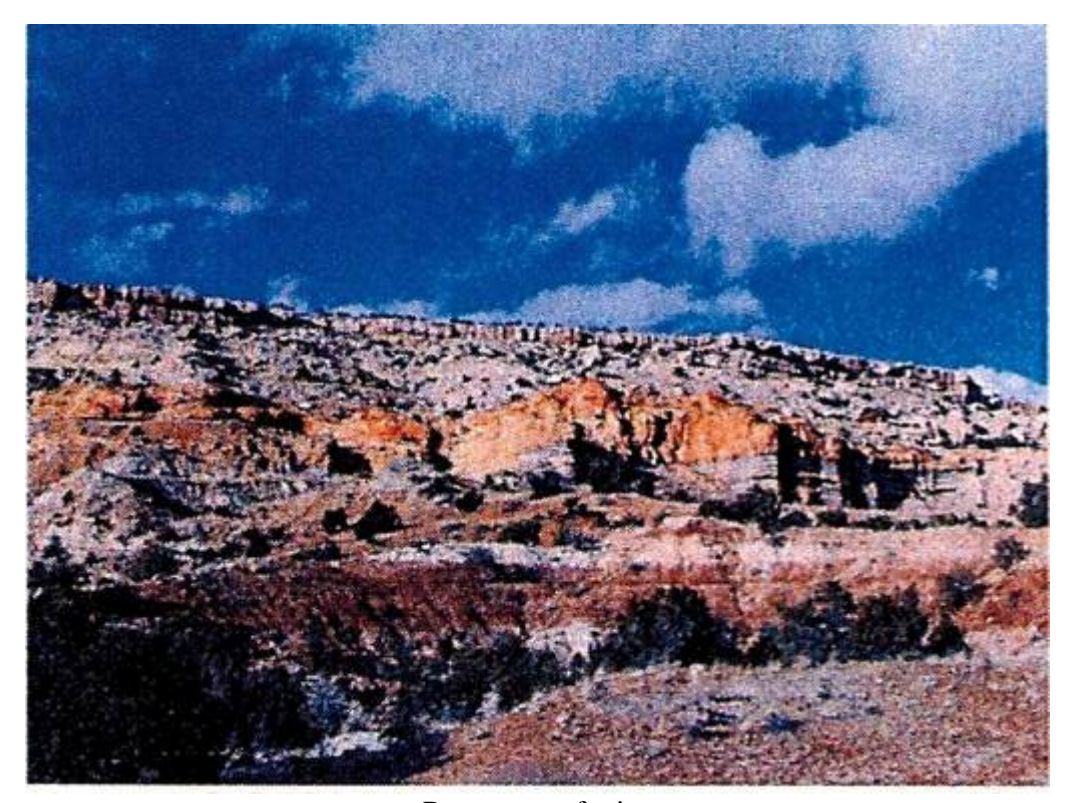
Panorama of mine