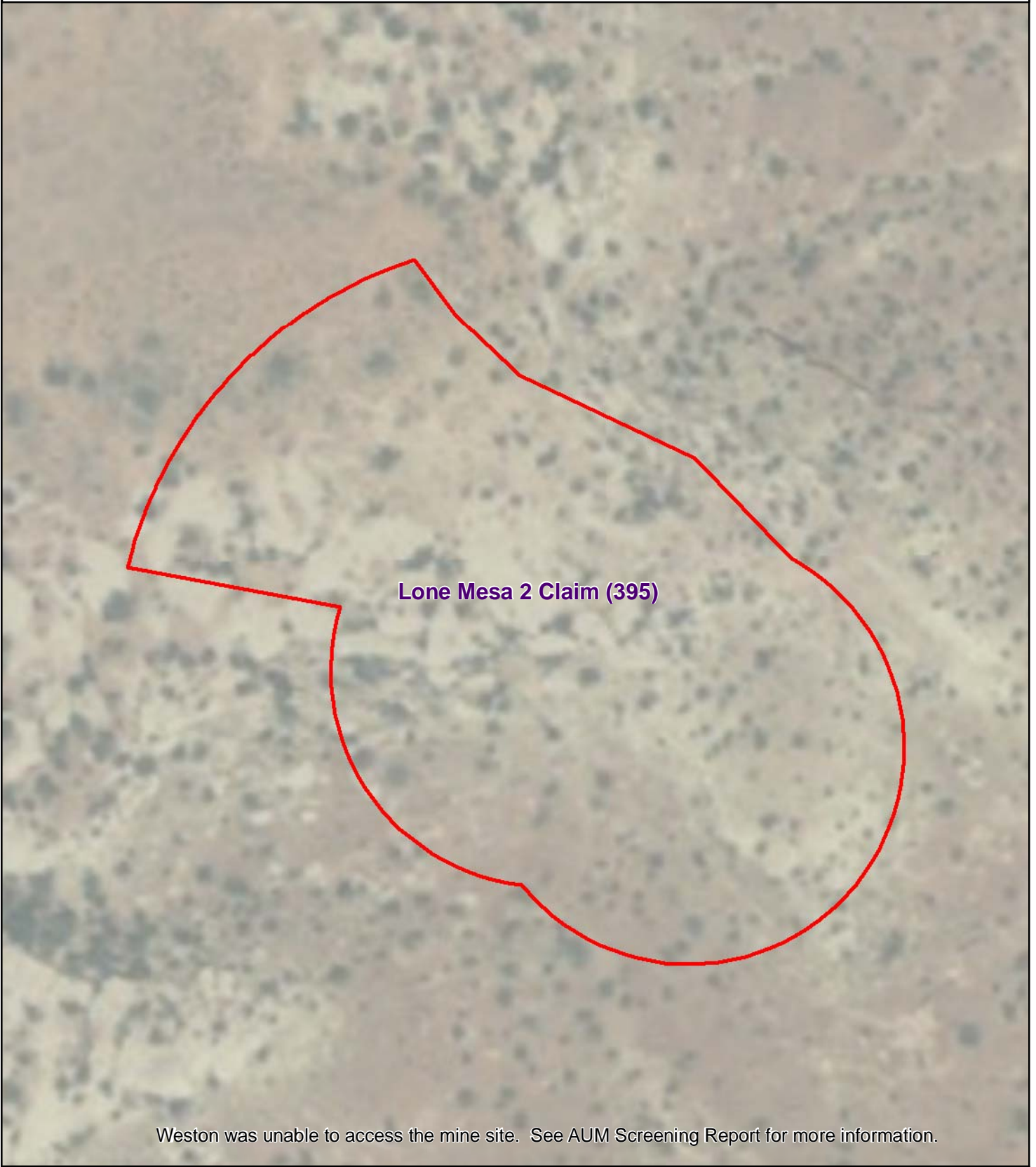
Figure 1 - Inaccessible Lone Mesa 2 Claim (395) Oljato Chapter, Navajo Nation

Weston was unable to access the mine site. See AUM Screening Report for more information.