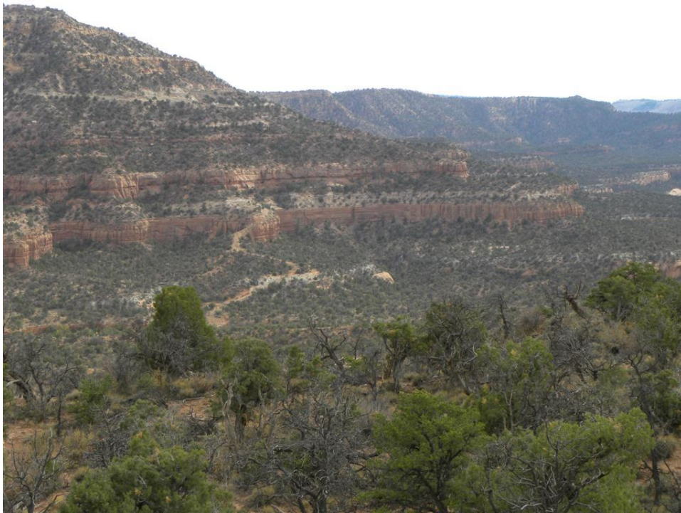
Photo 2. Direction towards site