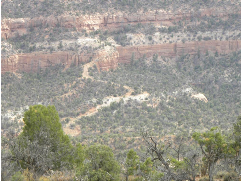
Photo 1. Direction towards site