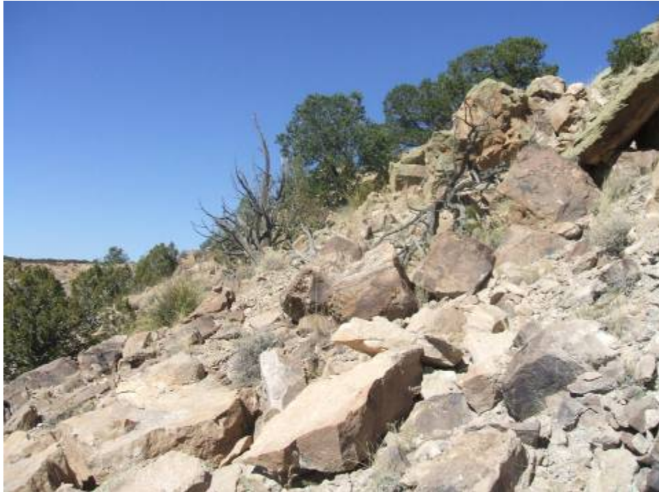
Photo 1. Down-slope of Section 1 mine site, towards the west