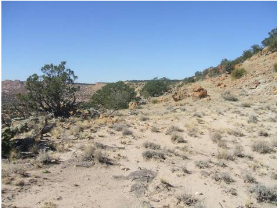
Photo 3. Plateau section of mine site, towards the west