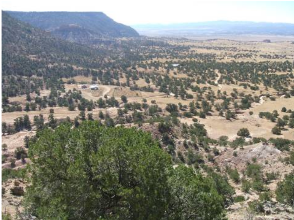
Photo 2. General vicinity of the mine site, towards the south