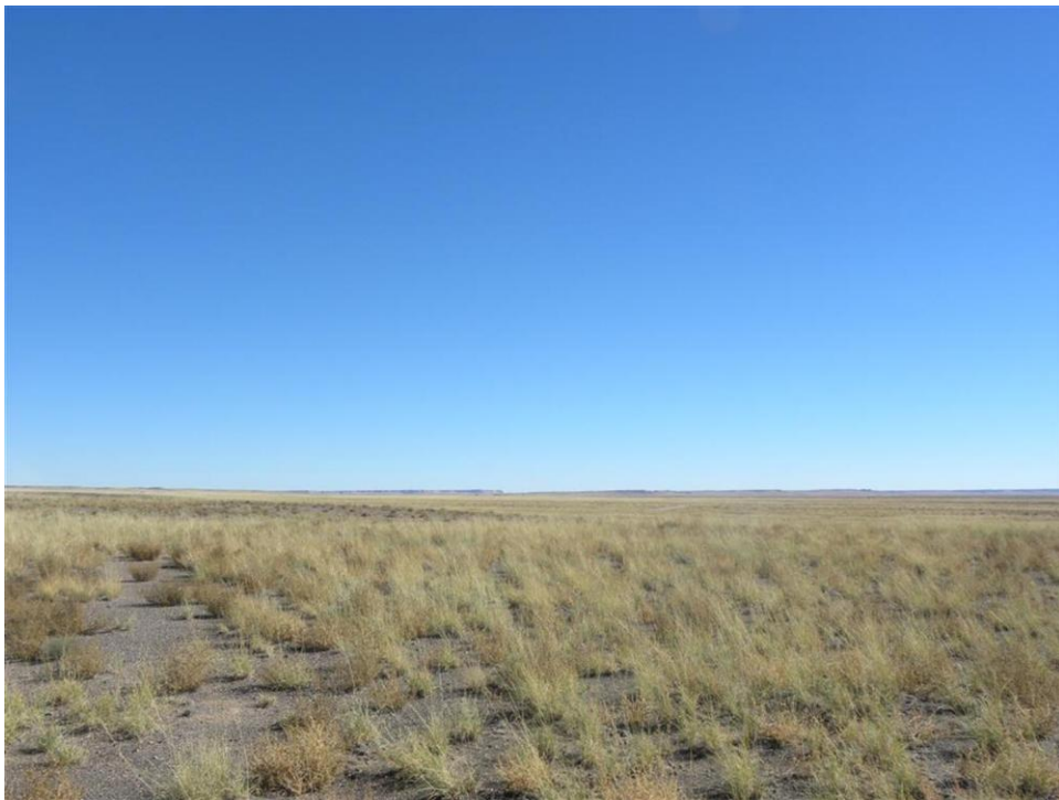
Photo 2. Amos Chee No. 2 and No. 3 mine site