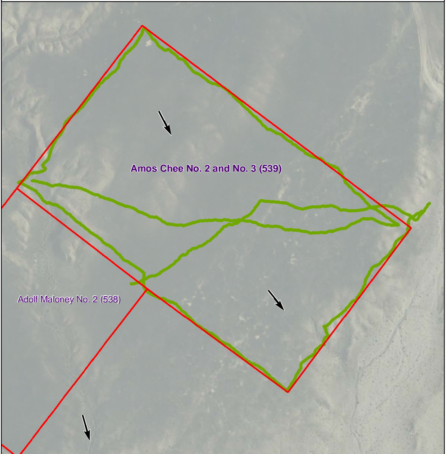
Figure 1 - Gamma Radiation Measurements, Above Two Times Background Amos Chee No. 2 and No. 3 (539) Leupp Chapter, Navajo Nation