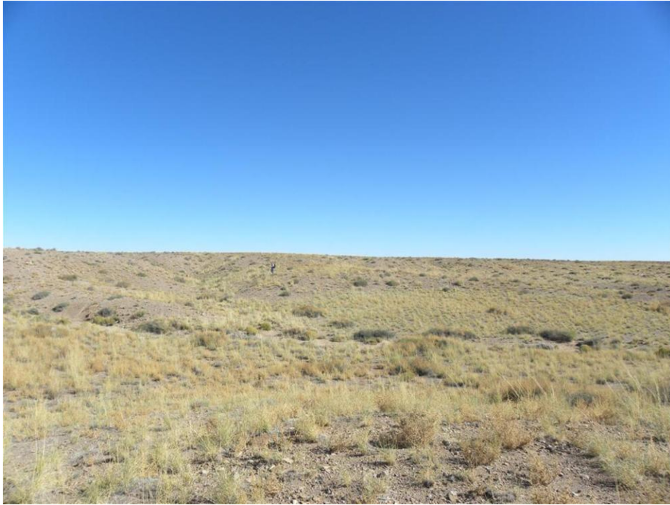
Photo 1. Amos Chee No. 2 and No. 3 mine site