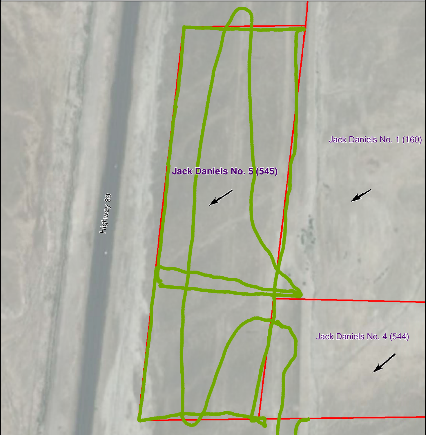
Figure 1 - Gamma Radiation Measurements, Above Two Times Background Jack Daniels No. 5 (545) Coalmine Mesa Chapter, Navajo Nation