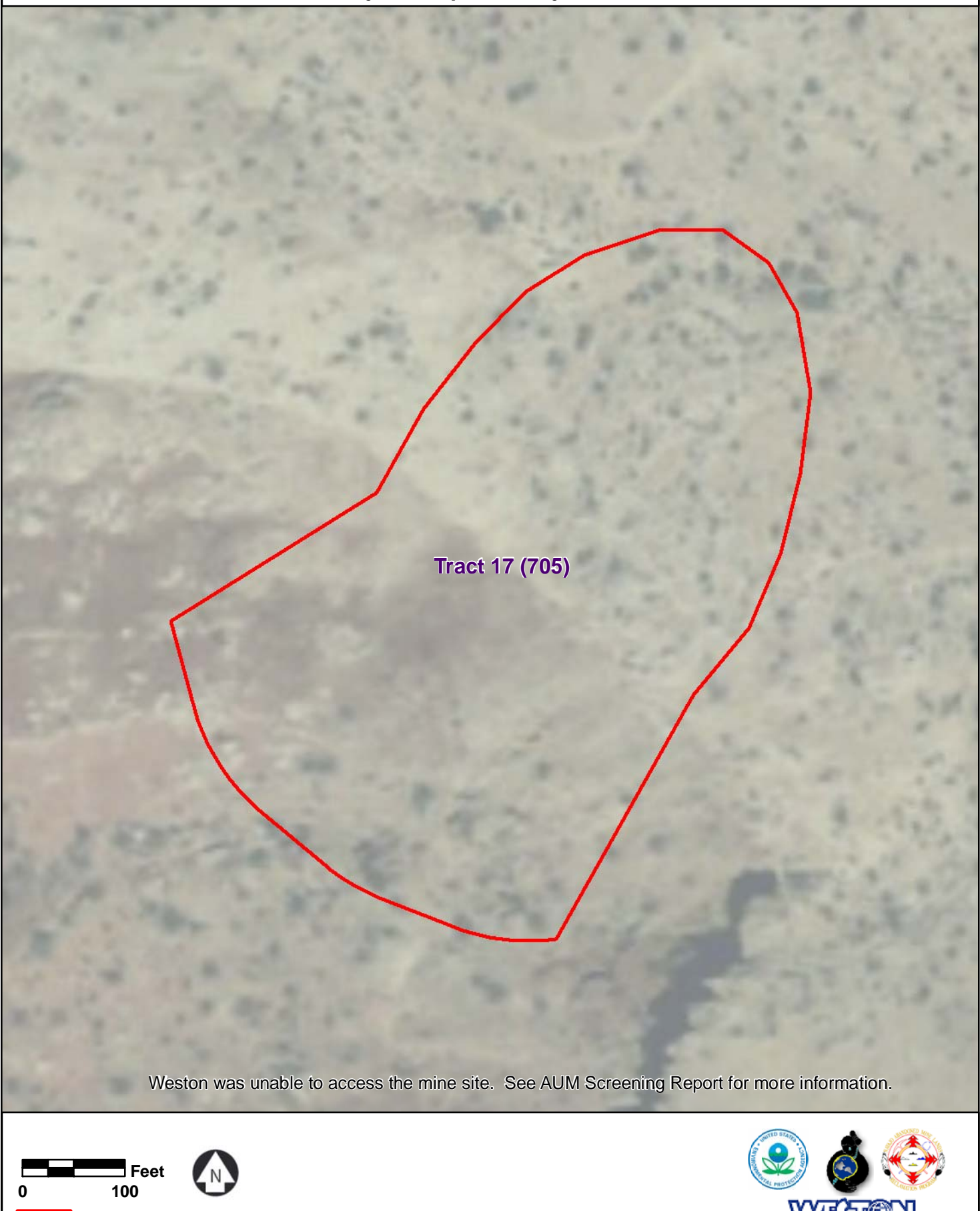
Figure 1 - Inaccessible Tract 17 (705) Oljato Chapter, Navajo Nation