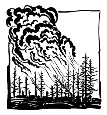
U.S. Environmental Protection Agency * U.S. Forest Service * U.S. Centers for Disease Control and Prevention * California Air Resources Board

Wildfire Smoke A Guide for Public Health Officials Revised May 2016