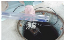
Manually checking brine sensor