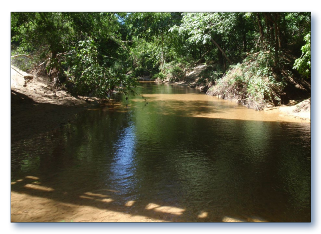
Figure 2. Sulphur Creek in southeastern Oklahoma is a shallow, sandy-bottomed stream.