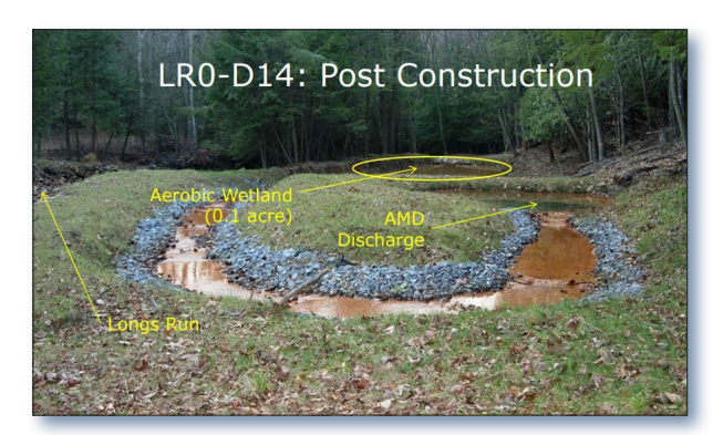
Figure 3. At site LRO-D14, AMD flows through an open limestone channel passive treatment system and into a small aerobic wetland before discharging to Longs Run.

Of significance, while metals were beneficially reduced by an order of magnitude, hot acidity was completely neutralized post-treatment. This indicates water quality had become net alkaline, a necessary step toward the reestablishing a stable and robust aquatic ecosystem. It should also be noted that the otherwise pristine nature of the Longs Run watershed, being 91 percent forested, positively contributed to its rapid recovery post-AMD treatment. Once Longs Run returned to its natural background chemistry and alkalinity, macroinvertebrates were able to drift downstream from healthy refugial tributaries to readily recolonize the restored main stem.