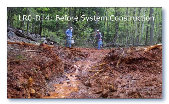
Figure 2. Before project implementation, AMD flows emerging from a seep in the hillside caused erosion and carried pollutants.